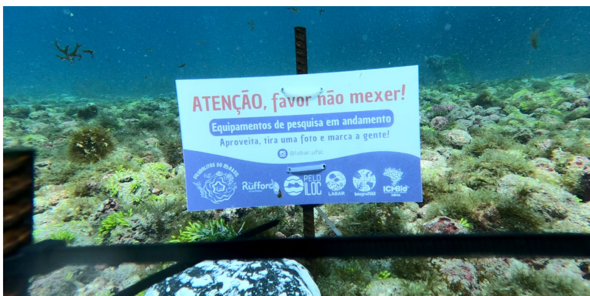
Photo 2: The plate was placed and left at the experiment site on the rhodolith bed of Resurreta during the fieldwork days.