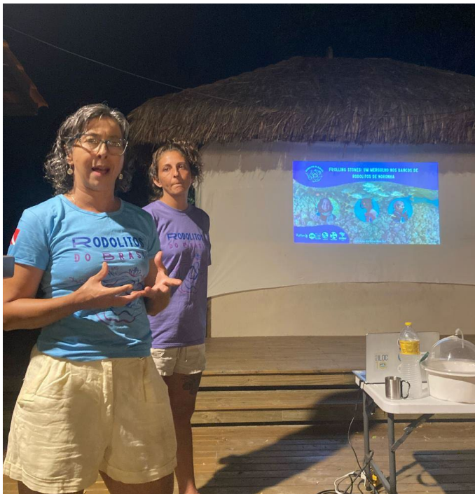
Photo 1: Opening of the lecture given in Fernando de Noronha in February 2025.

strategic points on the island of Fernando de Noronha. The brochure was distributed at the environmental education centers of the TAMAR Project ( https://www.tamar.org.br/ ) and the Fernando de Noronha Marine Park, as well as at the two local state schools (Escola Arquipélago and the Bem-Me-Quer preschool), and diving schools (Àguas Claras, Atlantis, Noronha Divers and Sea Paradise). The document used to produce the brochure is attached to the email containing this report.