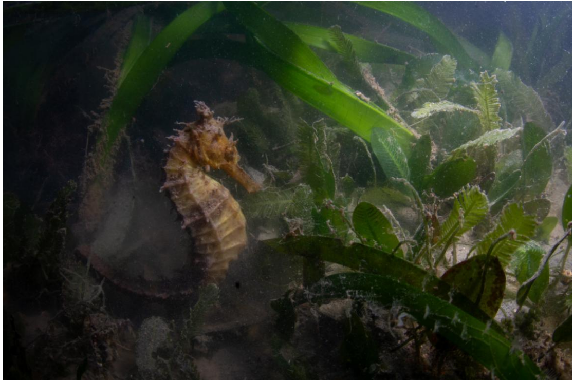
Hippocampus kuda in the water at the Merambong shoal.