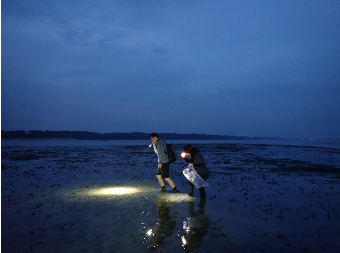
Looking for seahorses at the Merambong shoal, Johor.