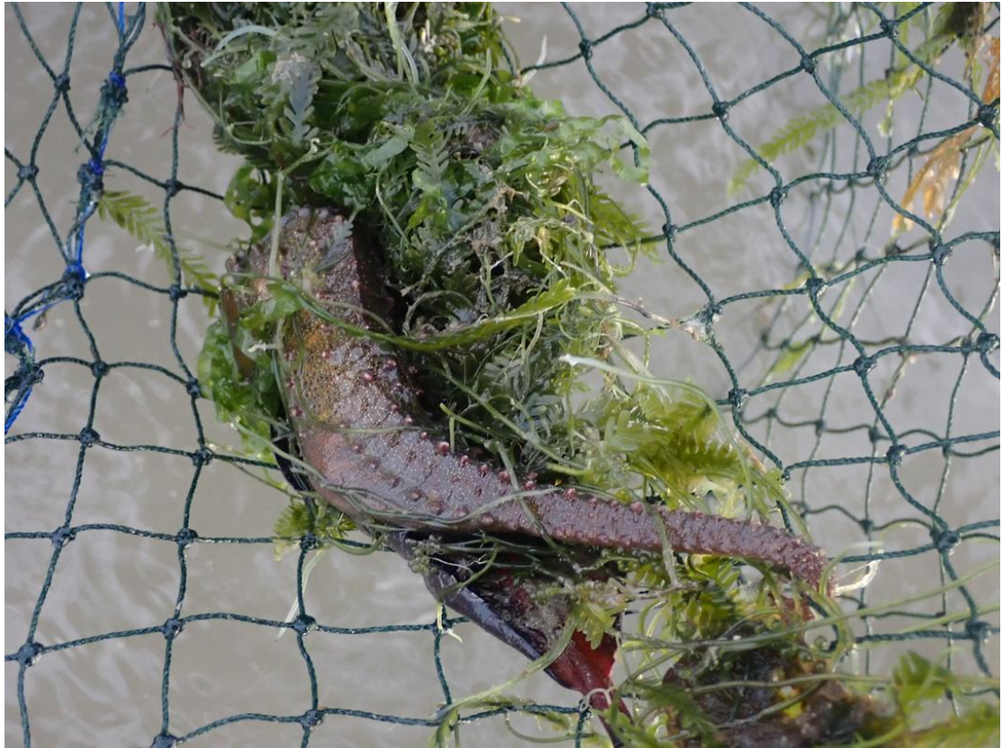
A pregnant male seahorse found in the pull net.