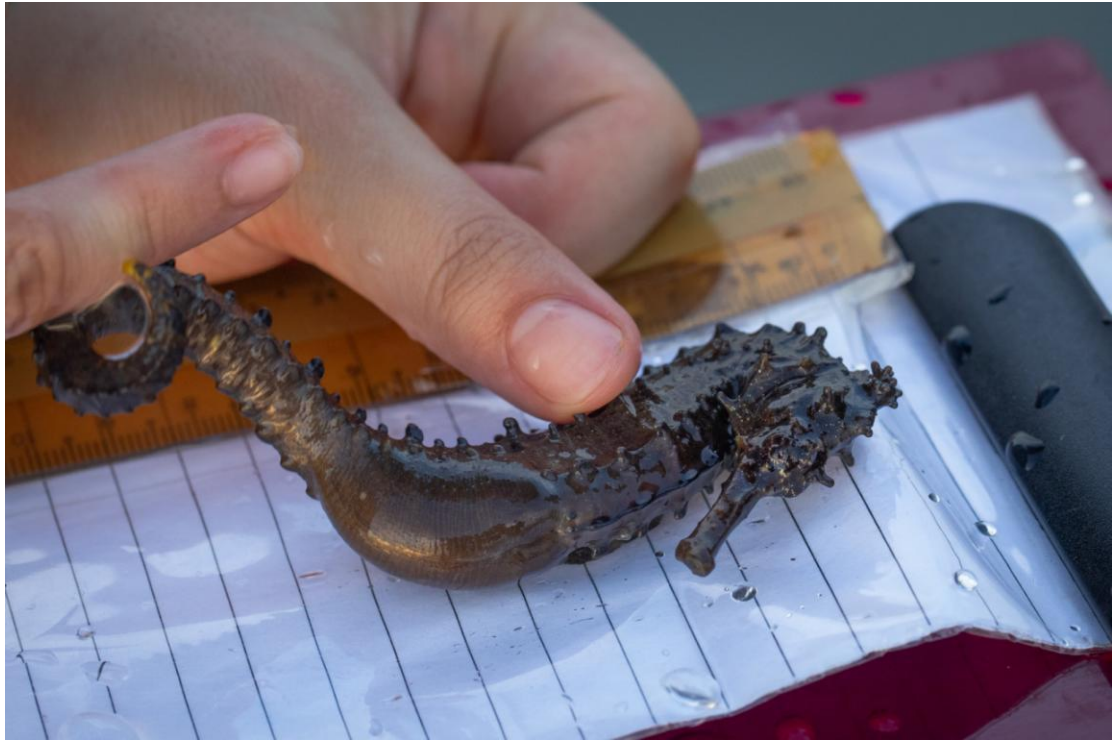
Measuring a pregnant male seahorse.