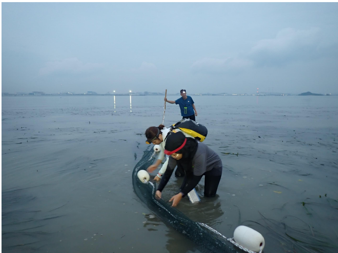
Looking for seahorses with the use of a pull net.