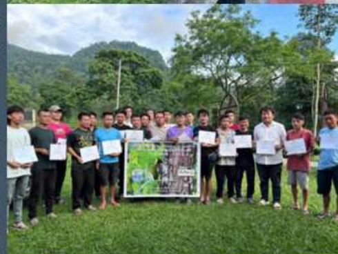
Participants proudly display their certificates after the successful completion of the training.