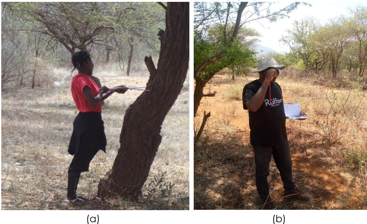
Figure 5: (a) Measuring the DBH by using a Calliper (b) Measuring the tree height by using a Suunto Hypsometer

This technique was used in the 20x20m quadrats established for the determination of shrub and tree carbon stocking capacity. The diameter at breast height (DBH) and the plant height were measured by using a vernier calliper and a Suunto Hypsometer, respectively (Fig. 5).