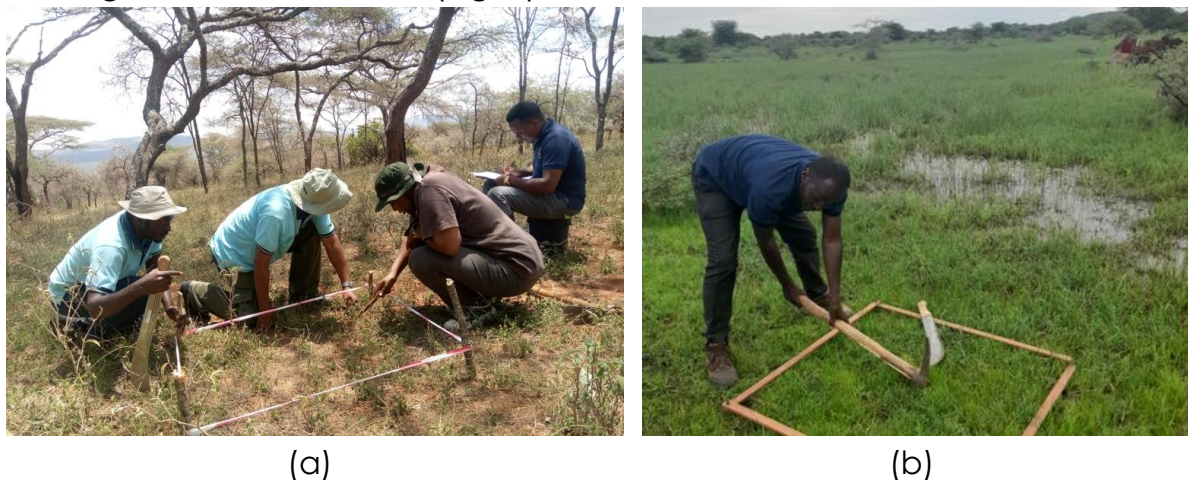
Figure 6: (a) Sampling the herbaceous species during dry season (b) Sampling the herbaceous species during rainy season

The herbaceous species contained in the quadrat were clipped off at 1.5 cm above the ground using hand sickles to enhance estimation of the above-ground carbon. The roots of the herbaceous species were also collected after clipping or separation from leaves and stems to enhance estimation of the below-ground carbon stock (Fig. 6).