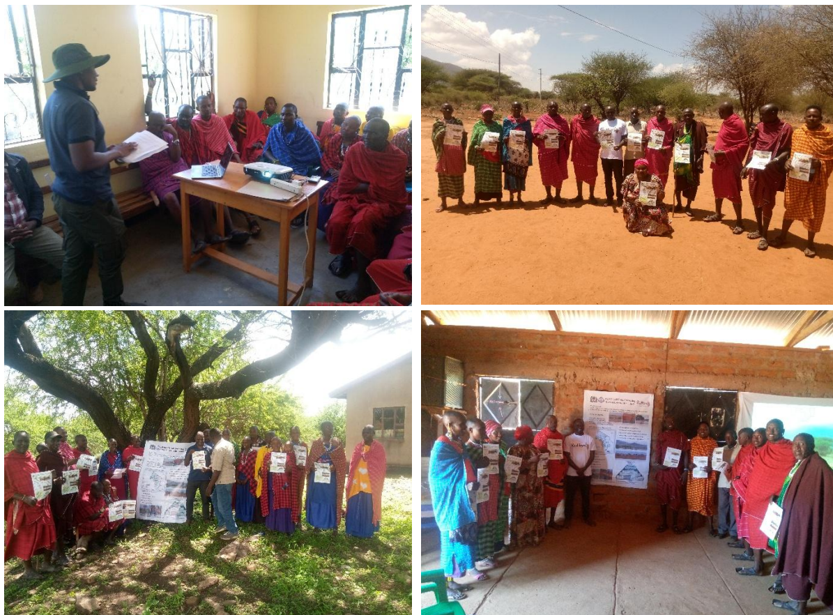
Figure 1: Project team conducting community sensitization workshops in the study districts

Five districts, each represented by one sample village, were visited, and community education was provided through a three-day workshop involving 150 participants (30 from each sample village). The five villages were Gelailumbwa in Longido District, Mswakini Juu in Monduli District, Oloirobi in Ngorongoro District, Ruvu remiti in Simanjiro District and Ndedo in Kiteto District. The communities were informed about the changes in the northern Tanzania rangelands, their drivers, and the recommended solutions. Also, the conservation potentials of the Alalili systems were explained. This project made a reminder of the roles of the Alalili systems as a hub of fodder plants important for the restoration of degrading rangelands, and sustaining the community's livelihood (Fig.1).