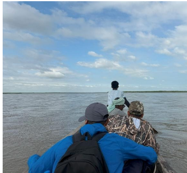
Photograph: River Guard (RG) members recorded the River Dolphin in the upper section of the Koshi Barrage in Madhuban, collected illegal fishing gears, set up a camera trap and monitored by RG in the Koshi River