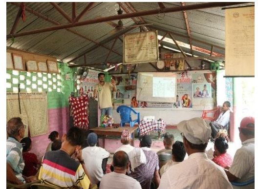
Photograph: Community awareness program conducted at different settlements, prioritizing farmers, river-dependent communities of the Koshi and Narayani River