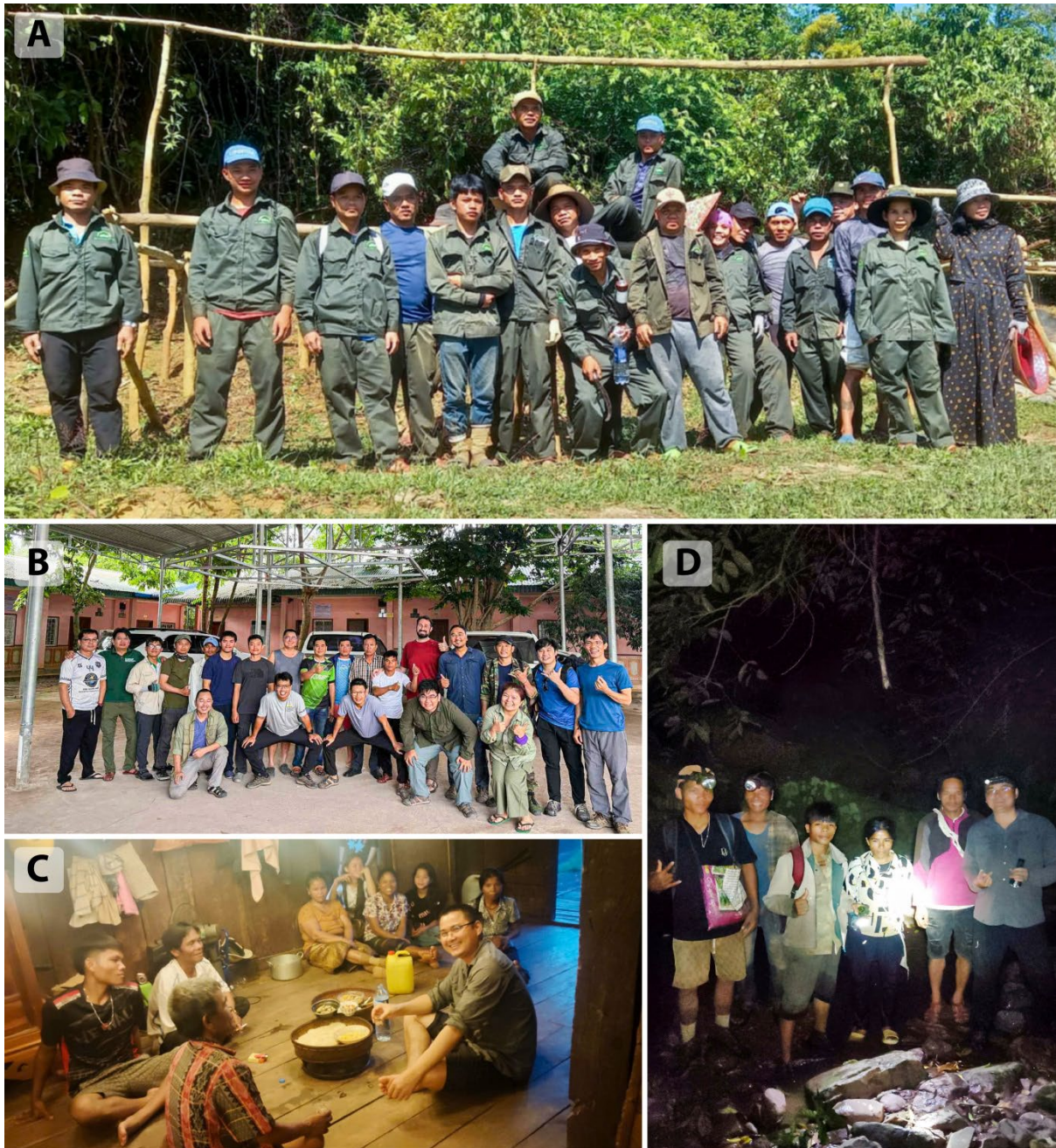
Figure 3. Field surveys and interviews conducted with local residents and rangers in central Vietnam.