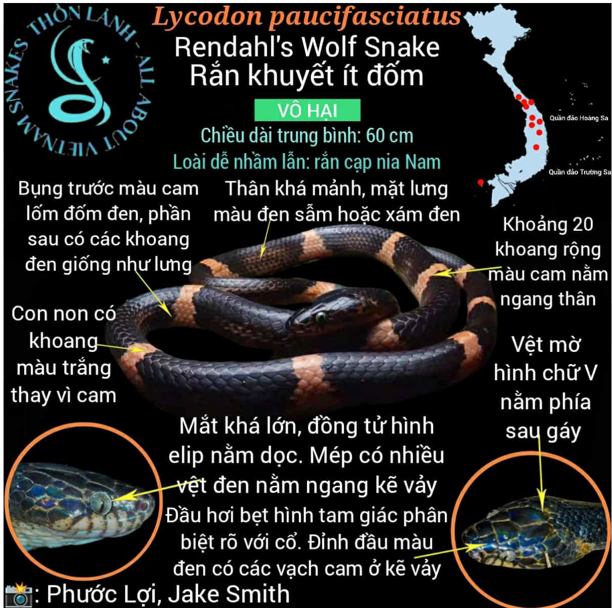
Figure 5. Field record and morphological characteristics of Lycodon paucifasciatus documented through the "Snake Identification and First Aid for Snakebites in Vietnam" Facebook group.