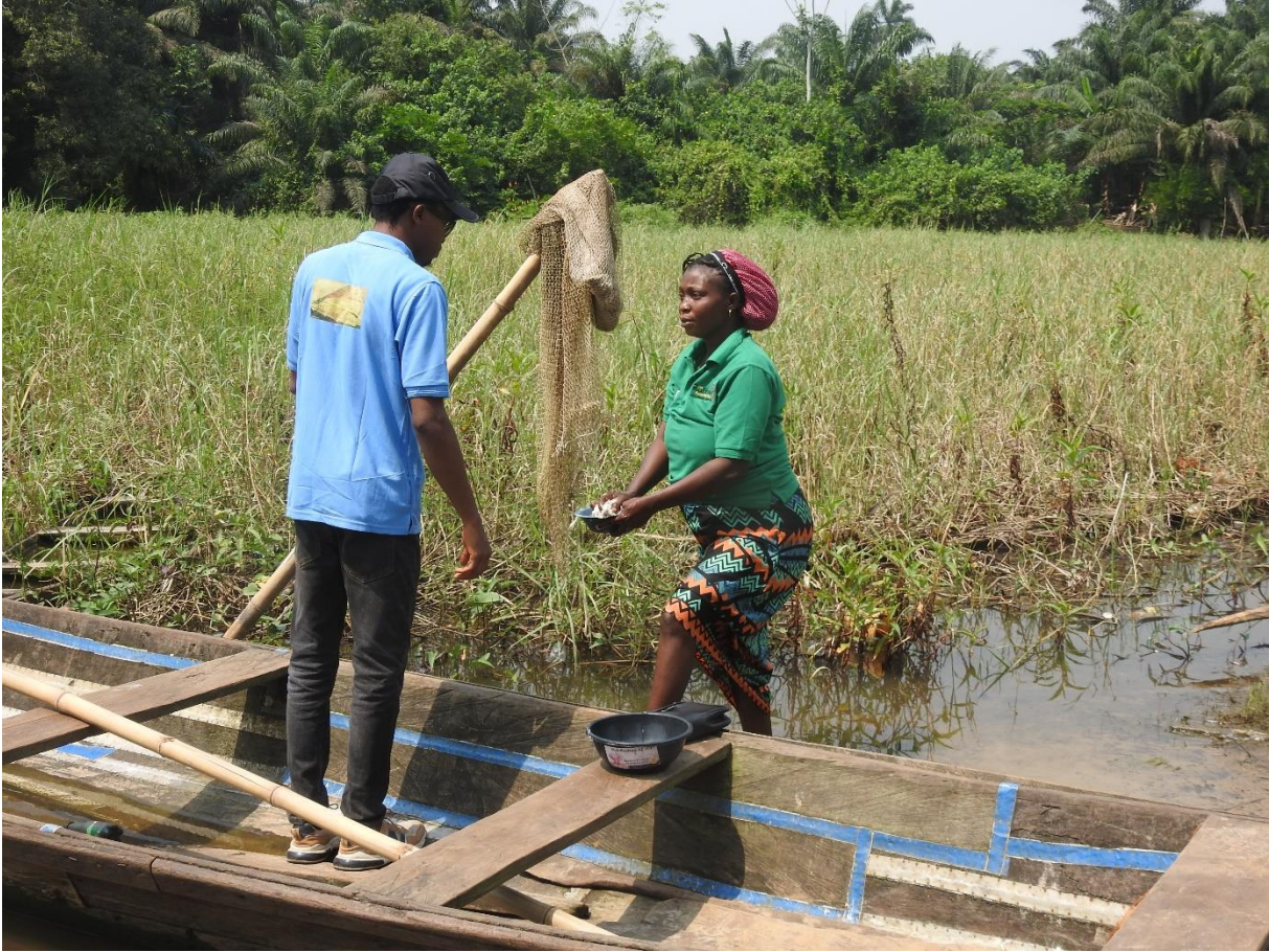
Image 6. A member of the project team interacting with a resident.