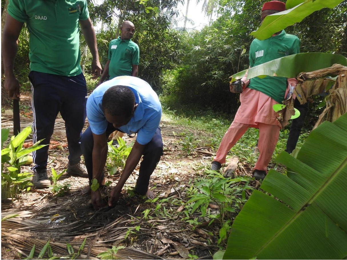
Image 8. Baale of Sunmoge planting a tree.