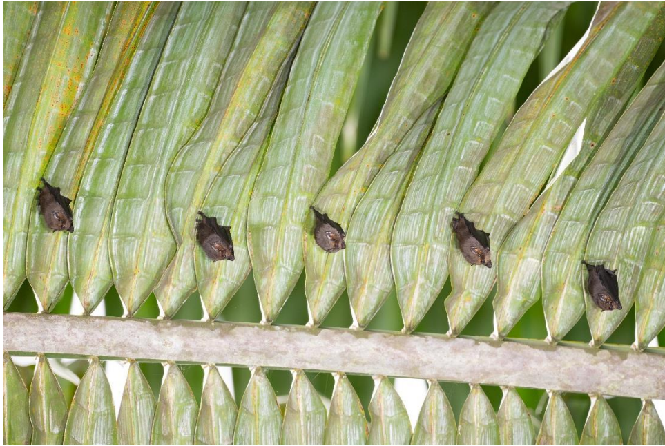
Figure 5. A colony of short-eared bats ( Cyttarops alecto ) found in our last visit to Cerro Waylawás (May 2026). This is an extremely rare bat species in Central America, and this record increases the global known range of the species over 100km northwards from the closest previous record.