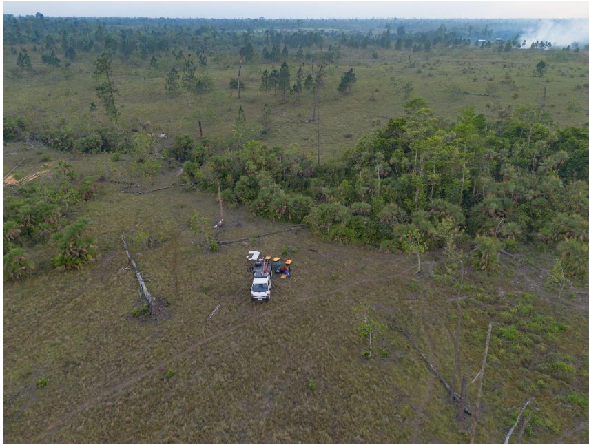
Figure 3. Bat survey team in the Caribbean pine savanna near Alamikamba, Nicaragua. Note the wildfire in the grasses in the top right corner of the image.