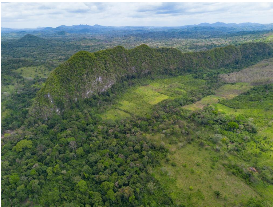
Figure 4. Cerro Waylawás, near Siuna, Nicaragua. This is our proposed site to be internationally recognized as an Important Site for Bat Conservation. We have found 28 bat species in the caves and surroundings of this unique geological formation.