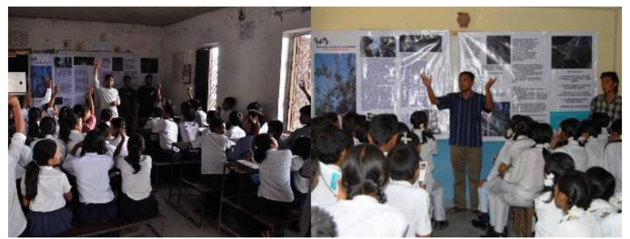
Lecture to schoolchildren at Chobhar