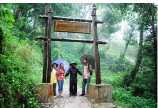
Hiking at Sundarijal