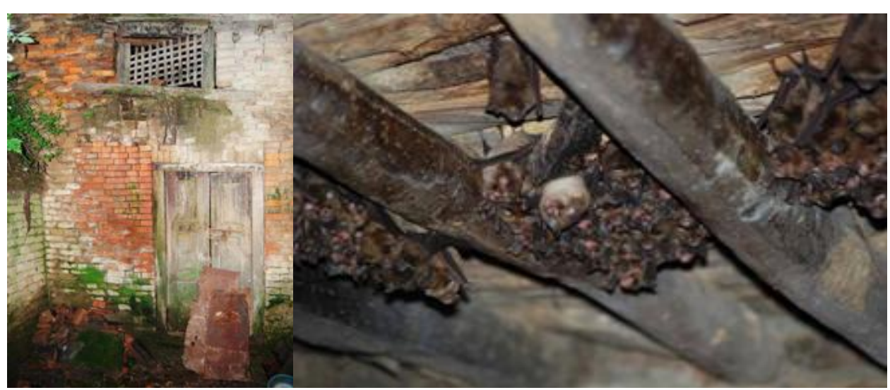
An old abandoned house at Sankhu roosted by R. affinis colony