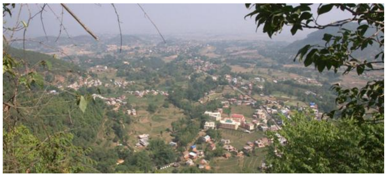
View from Godawari Cave

The site lies within one-kilometer periphery of 27°35'42.08"N 85°22'40.81"E, at an elevation of 1524m a.s.l. The area is moist, drained with water streams, north facing slope, dense vegetation of Chestnut Castanopsis indica (Katus), Box Myrtle Myrica esculenta (Kafal), Plum Prunus cersoides (Paiyun), Alder Alnus nipalensis (Utis), Schima walichii (Chilaune), Oak Quercus sp. , Rhododendron Rhododendron spp. (Gurans), Walnut Juglans regia (Okhar), Michelia champaca (Chaanp) etc. Common Leopard Panthera pardus (Chituwa), Indian Crested Pocurpine Hystrix indica (Dumsi), Squirrels, Bats are mammals sited frequently in the jungle. This area is famous for resident birds and butterflies.