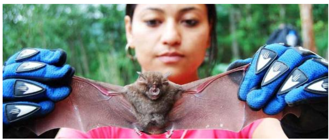
Handling R. affinis at Nagarkot