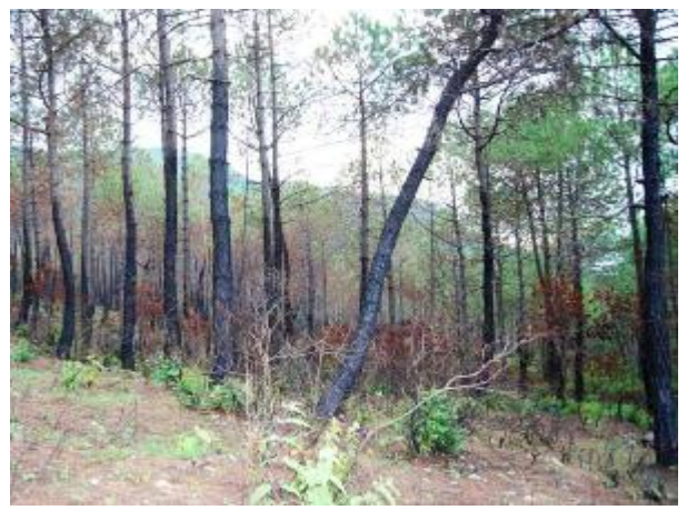
Forest fire at Machhegaun