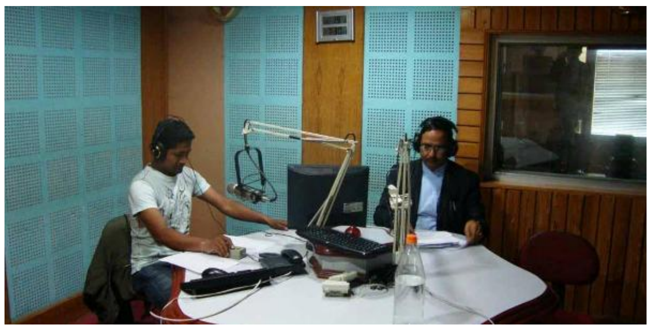
Interview with Secretary, Ministry of Forest and Soil Conservation