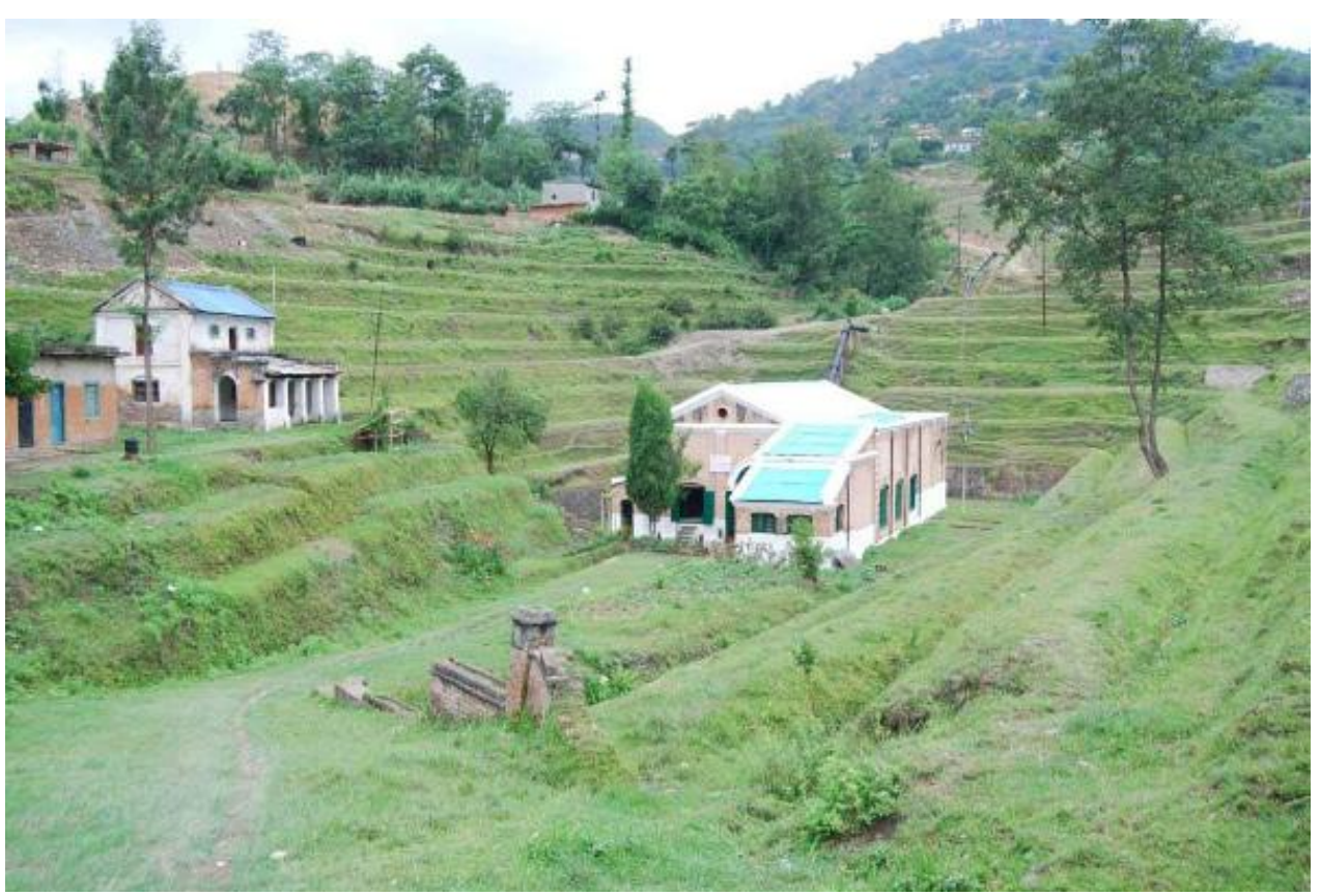
Pharping Hydro power plant