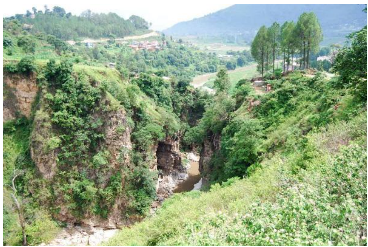
Chobhar Gorge and Cave

This is another culturally important site dominated by Pinus roxburghii forest and famous caves of Nepal are located. The topography shows that hills of the gorge are mainly composed of limestone and dolomite. There are four caves Manjushree cave, Bagh cave, Naya cave, and Barahi cave in this area. This area lies within 500 meters of 27° 39' 35.3" N, 85° 17' 39.2" E, and elevation 1404m a.s.l.. Hipposideros cineraceus from the Eastern entrance of the cave was captured on September 16, 2008. Numerous individuals were seen wandering during and noticed their flight at 6 PM (Thapa et al. 2009).