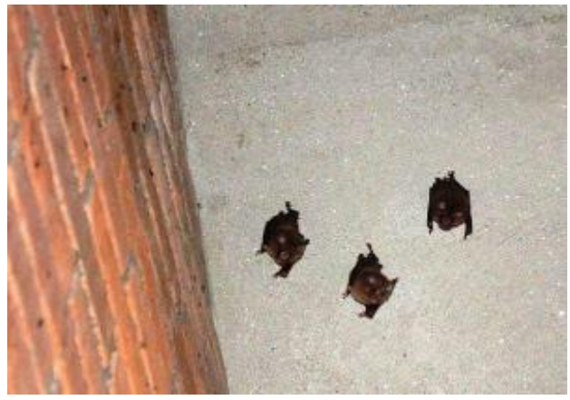
Rhinolophus affinis resting under ceiling at Godawari