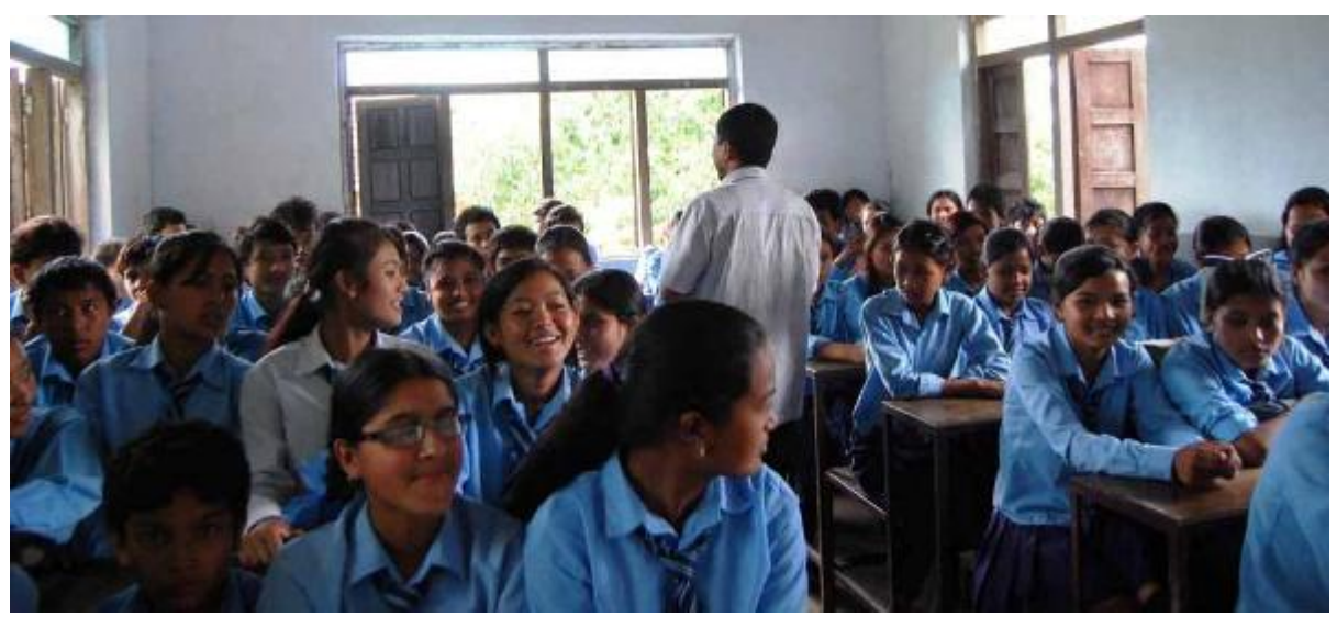
Lecture to school children at Machhegaun