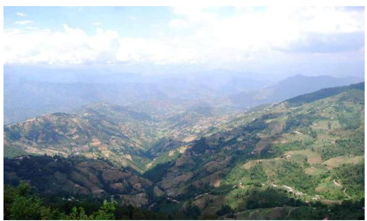
View from Nagarkot