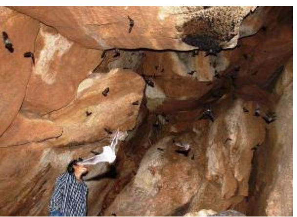
Colony of Myotis sp. at Godawari Cave