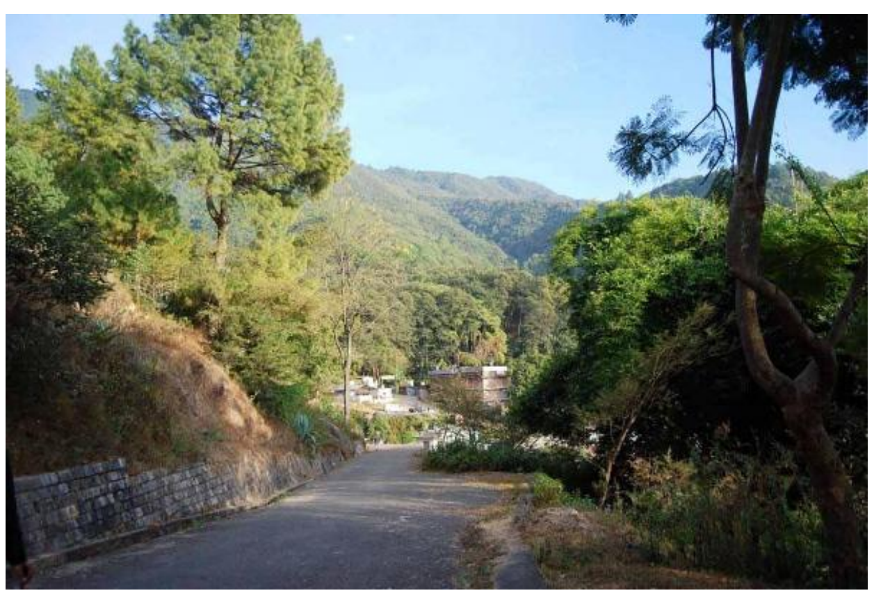
View at Panimuhan