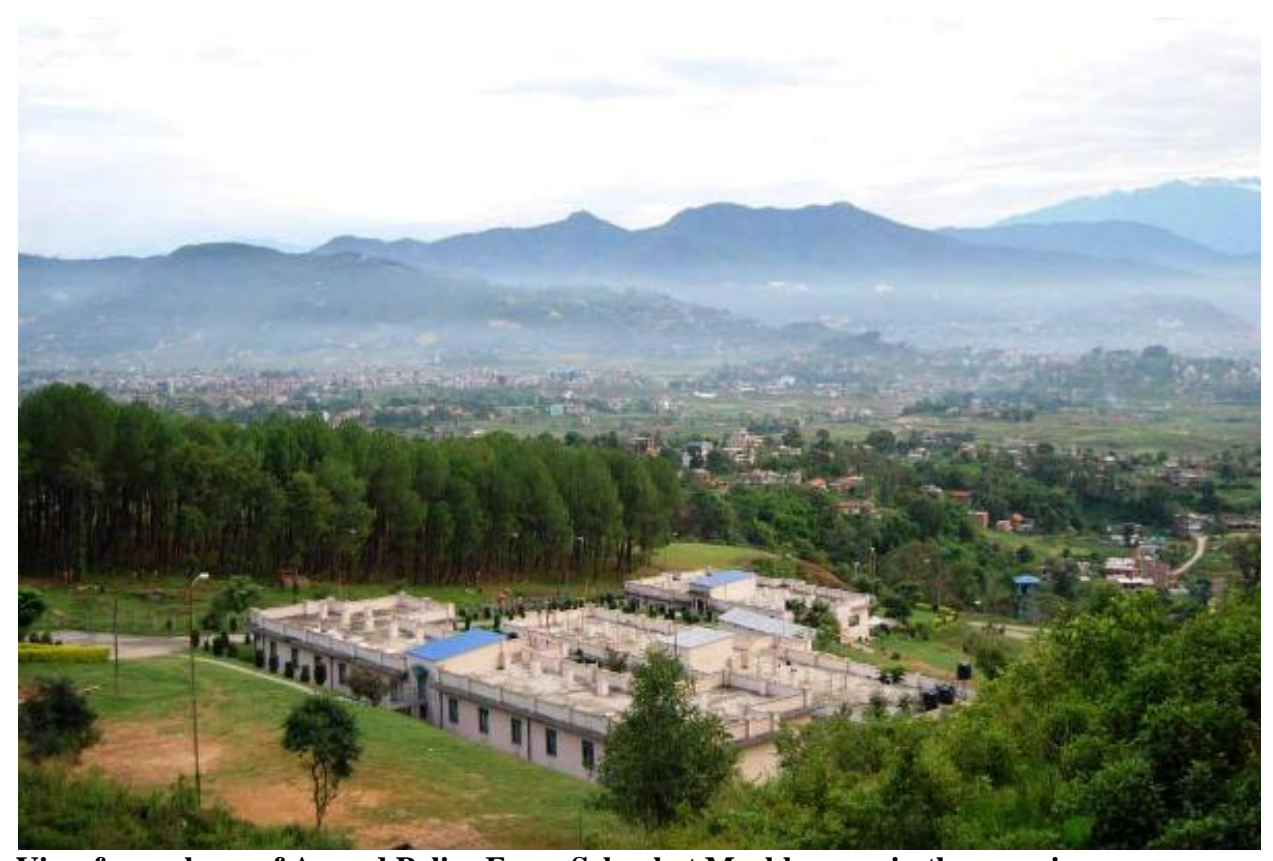
View from above of Armed Police Force School at Machhegaun in the morning

This area lies within one kilometer periphery of 27°39'38.75"N 85°15'13.63"E at an elevation 1493m a.s.l. This site is north facing and at the foot of Chandragiri. Myrica esculenta , Castanopsis indica , Pine dominates the vegetation.