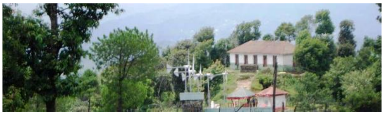
Turbines at Nagarkot