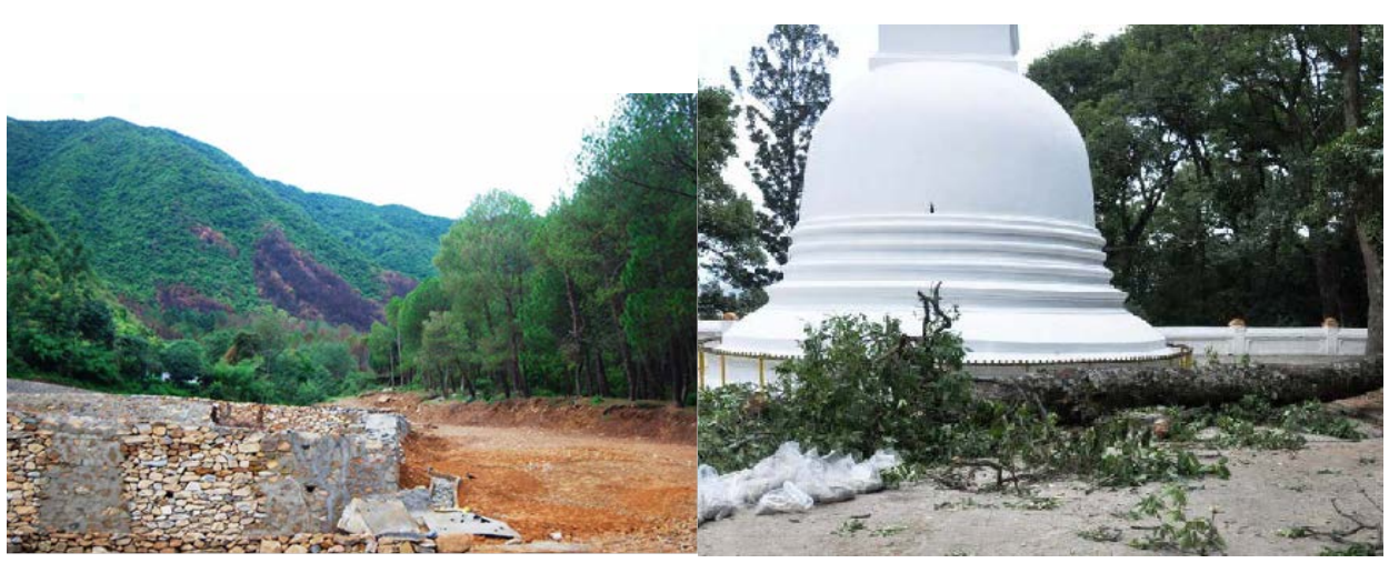
Habitat destruction at Mechhegaun