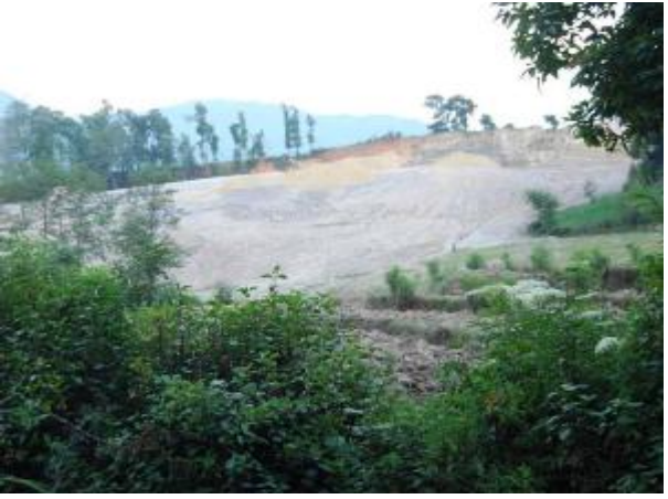
Habitat destruction at Bajrabarahi