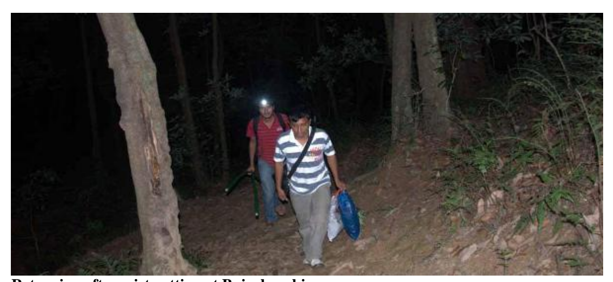
Returning after mist netting at Bajrabarahi