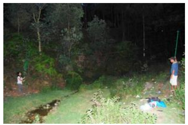
Mist netting at Machhegaun