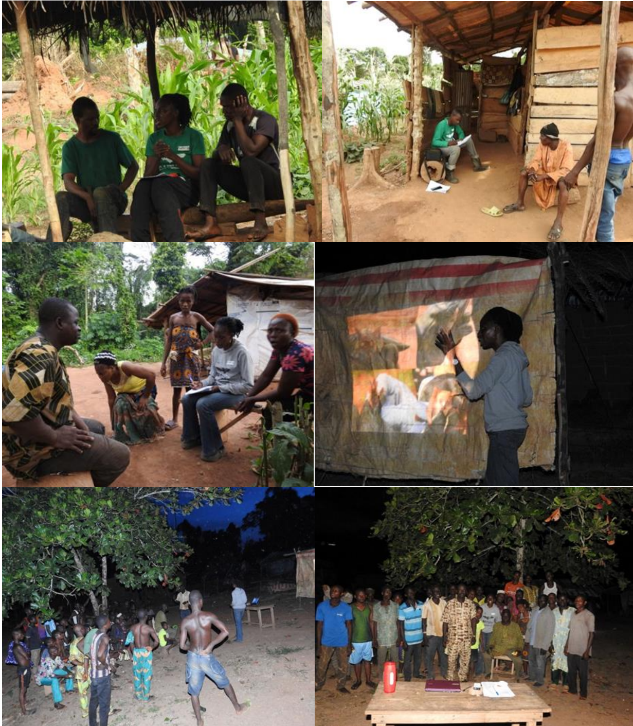
Questionnaire administration and community outreach at the Aba Gerald Agricultural Camp, OBR