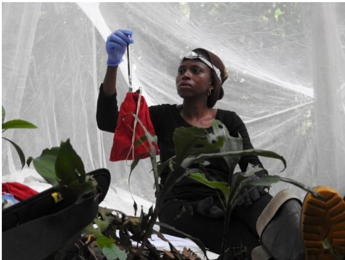
Measuring the bag and bat at the Strict Nature Reserve, OBR