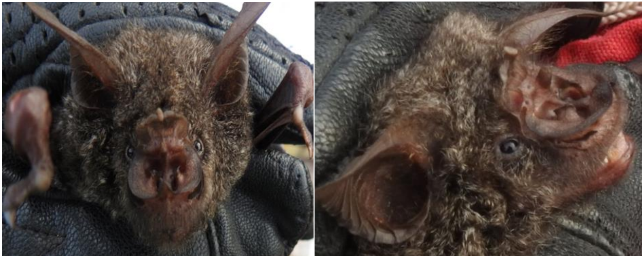
Front and side view of Cyclops Roundleaf Bat- Doryrhina Cyclops