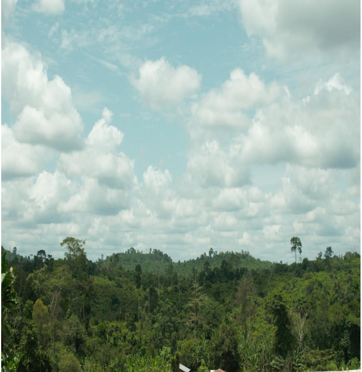
The Omo Biosphere Reserve View

Activities carried out include bat survey, conservation outreach to one of the target communities' as well as one of the target primary school within the reserve. Permit was granted by the Forestry Research Institute before field began.