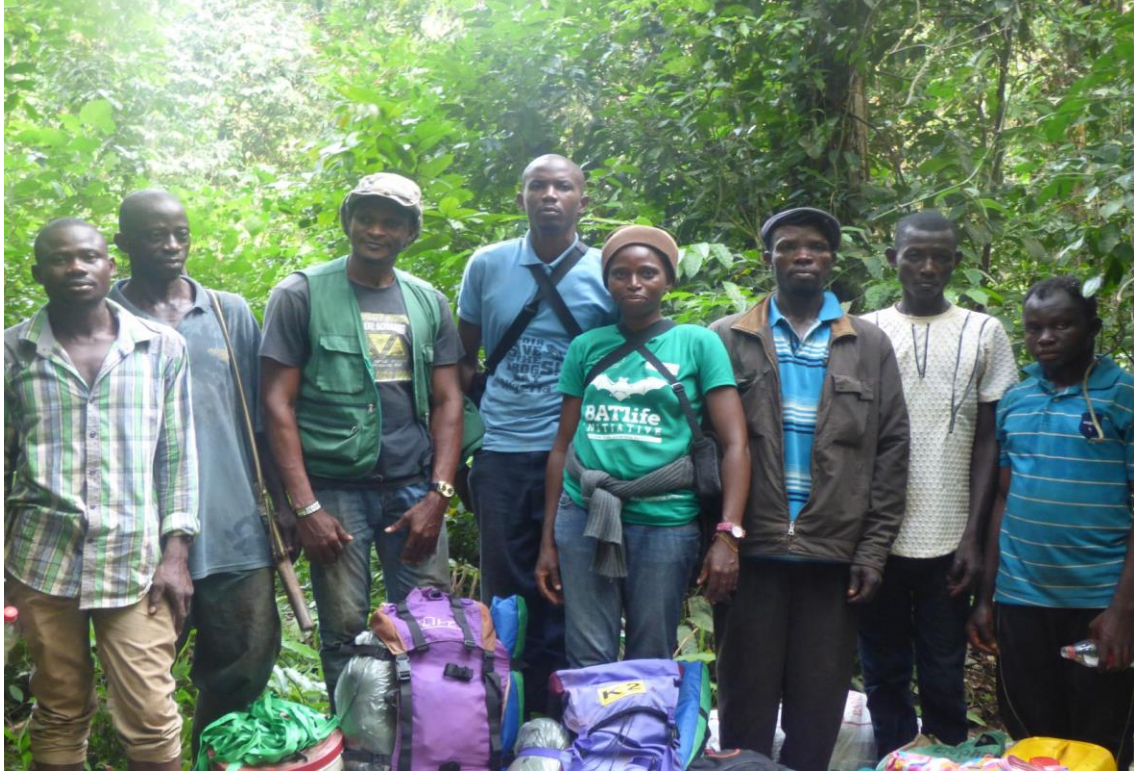
The Batlife Team and local assistants from the Gerald Village setting out into the Queens Forest (Strict Nature Reserve), Omo Biosphere Reserve