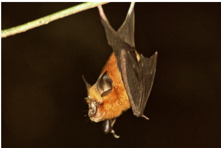
A released insect bat after morphometric data had been collected.