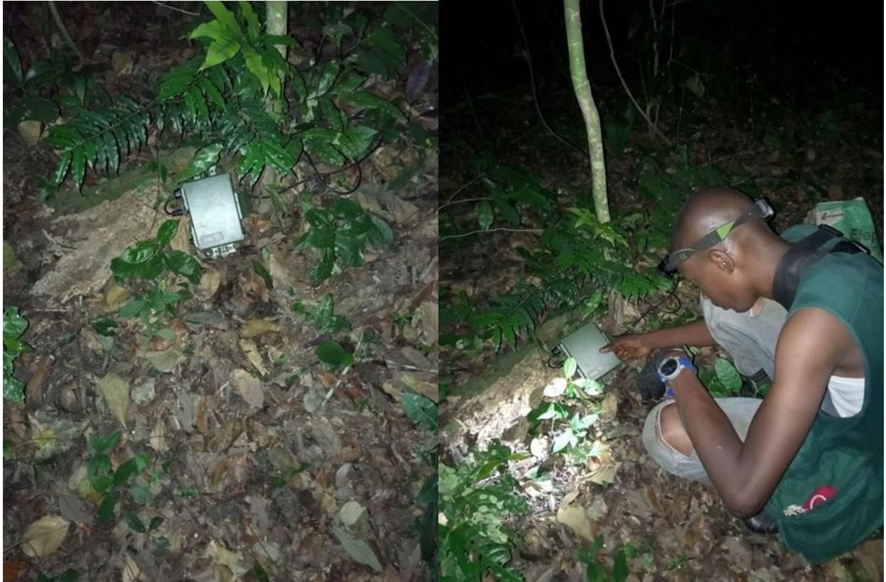
Setting up of and checking of the SM4FS Bat detector at one of the trapping point by one of the team member.