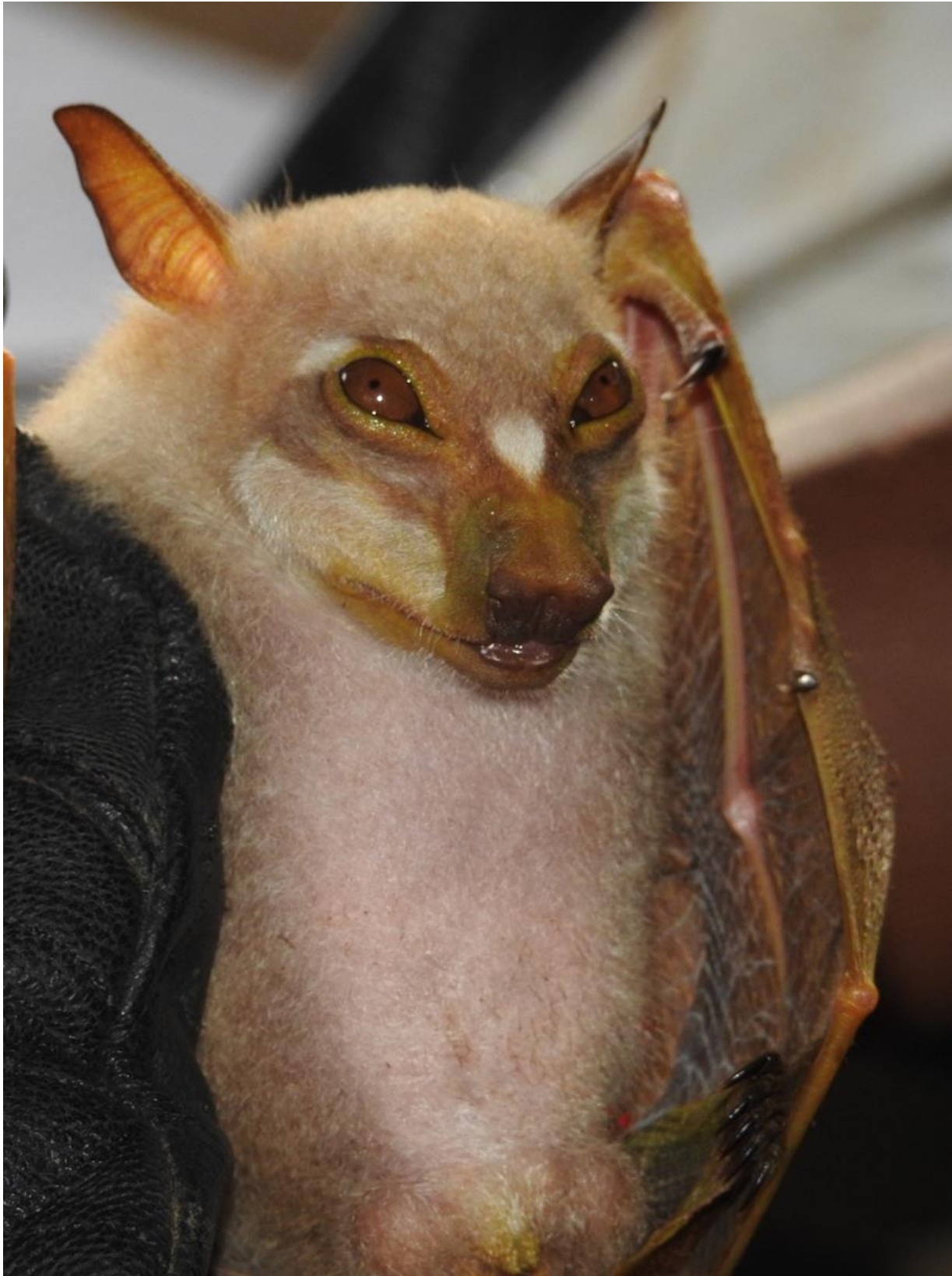
Pohle's Fruit Bat- Casinycteris ophiodon - New species to Nigeria