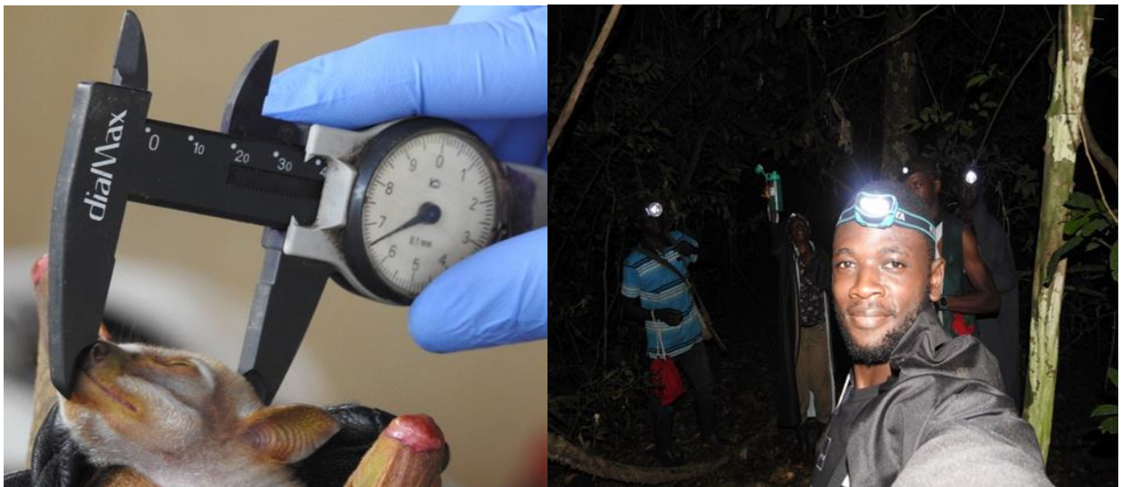
Total head length measurement and the team after a bat trapping night.