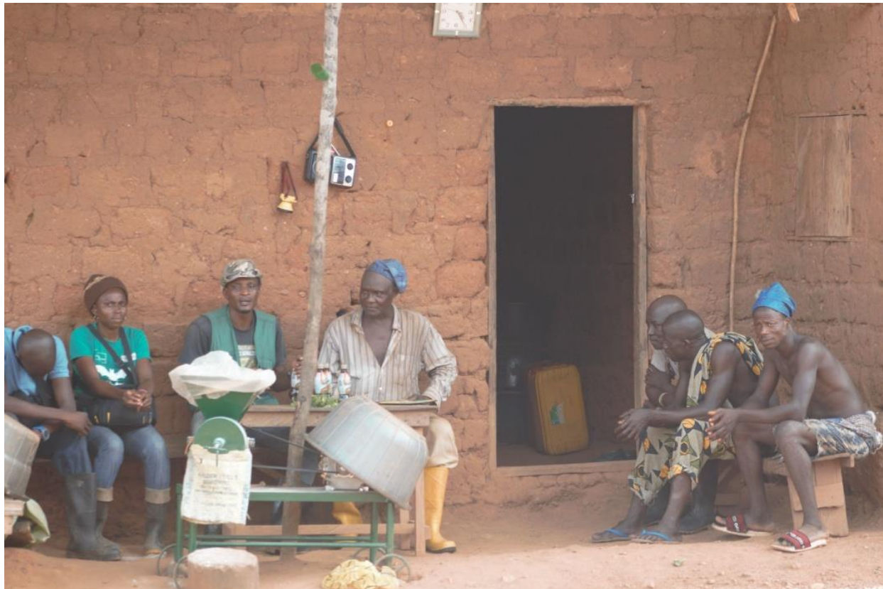
The Batlife Team, the Baale and the Subjects at the Aba Gerald Settlement, Omo Biosphere Reserve, OBR