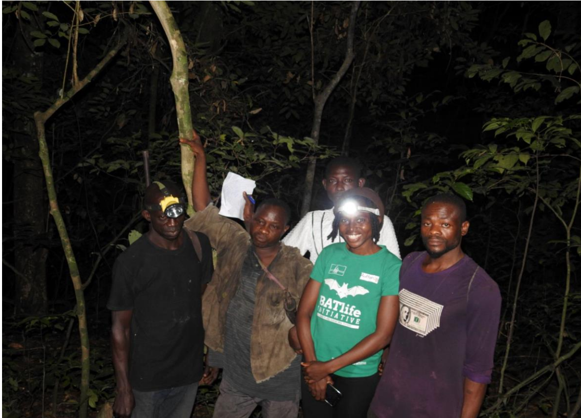
Batlif Team members and the poachers