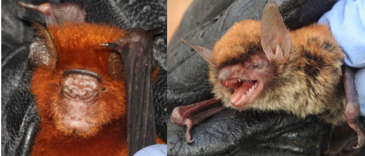
Left: Front view of Sooty Leaf-nosed Bat- Hipposideros fuliginosus . Right: Rufous mouse-eared bat- Myotis bocagii (New species to Nigeria).