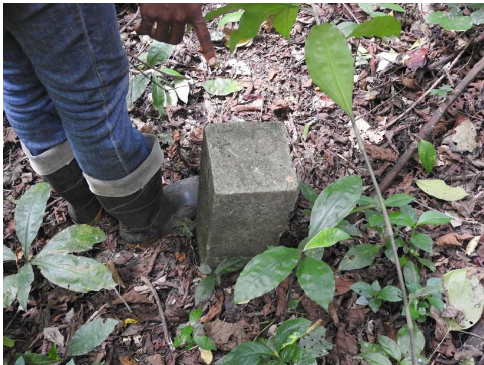
The pillar to show where the buffer ends and the start of the Queen's Forest.

This camp is one of the camps that is working with the Forest Research Institute of Nigeria (FRIN) for the protection of the core area of the reserve. They assist in monthly patrols so as to curb illegal activities such as hunting, snail gathering, felling of trees as well as mining. One of the forest guards/hunter/subjects (Mr Safejo) from the camp was assigned to us after agreement between the men of the camp to assist us during our stay within the Queens Forest. The agreement was for a ten night field work with an agreement that we remunerate him after the 10 nights work. We arrived at a stream which marked the beginning of the SNR close of Aba Gerald and we move in on foot for about 500 m before setting up camp