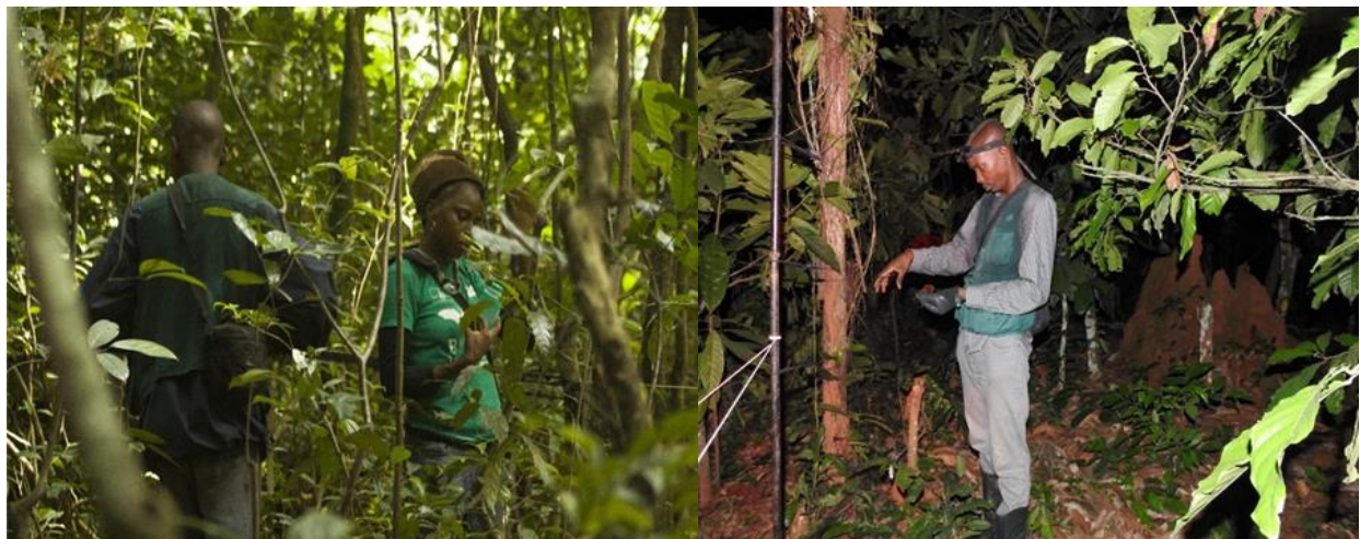
Marking out point for mist net setup and bat extraction from the net, Queen Forest, OBR, Ogun State