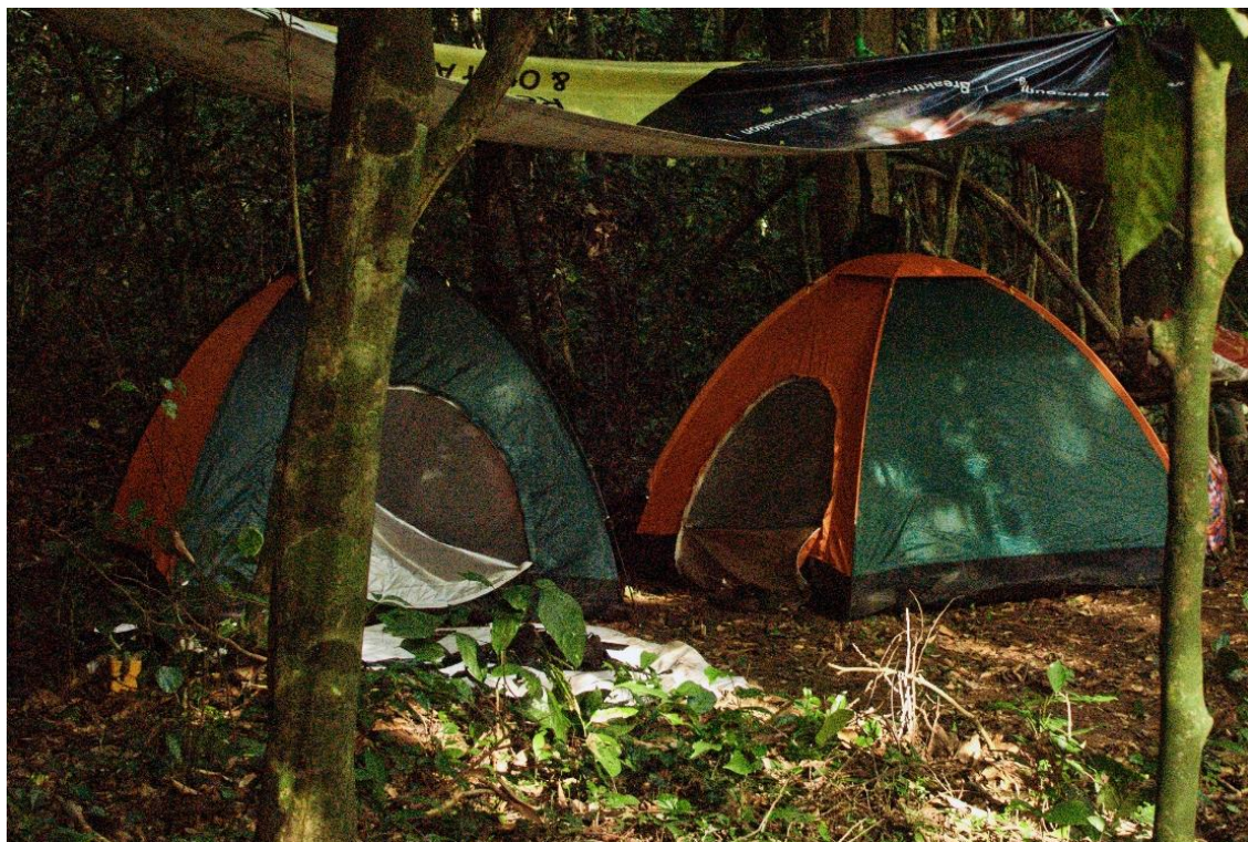
Second camping site in the Strict Nature Reserve at Omo