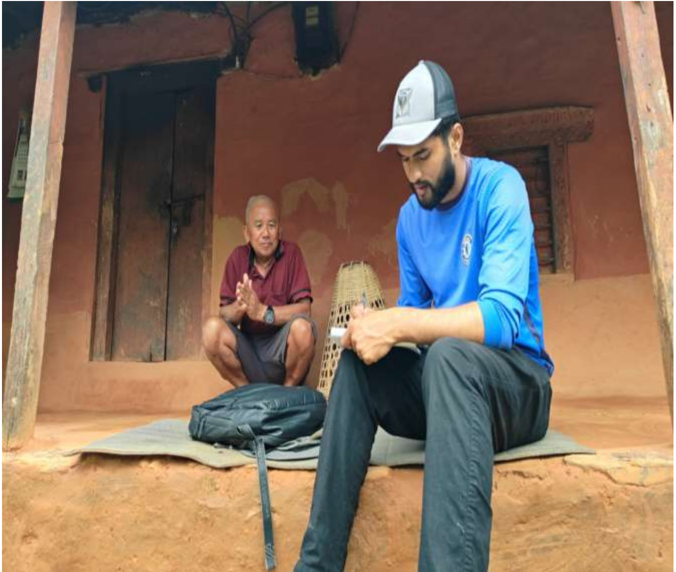
Fig 1: A questionnaire survey with the local resident of project site

nature and extent of human-wildlife conflict and perceptions toward wildlife conservation. In total, 59 household representatives participated in the survey.