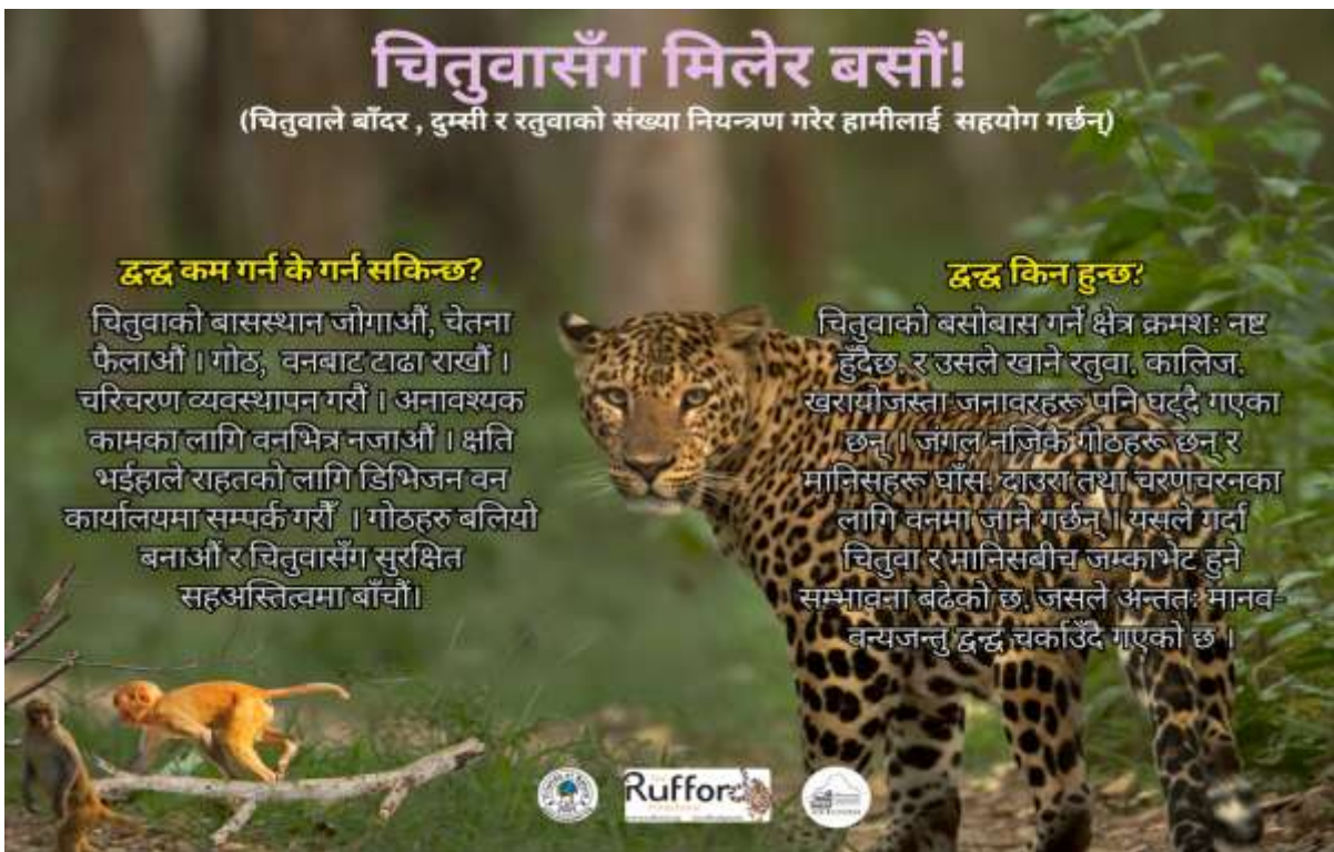
Fig 4: A poster on human-wildlife conflict and mitigation measures focusing Common Leopard (In Nepali Language)