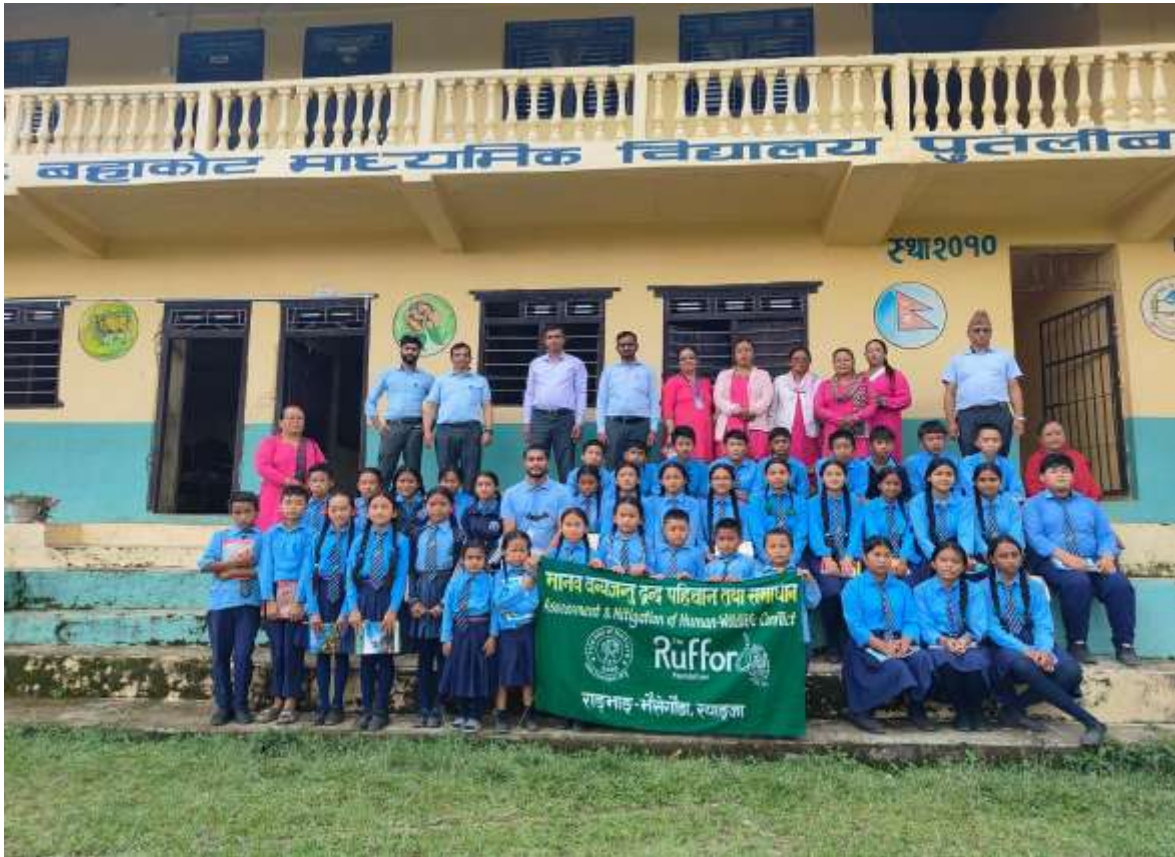
Fig 3: A group photo with teachers and students after a session on human-wildlife conflict.

Additionally, 200 educational posters highlighting practical conflict mitigation strategies were printed and distributed.