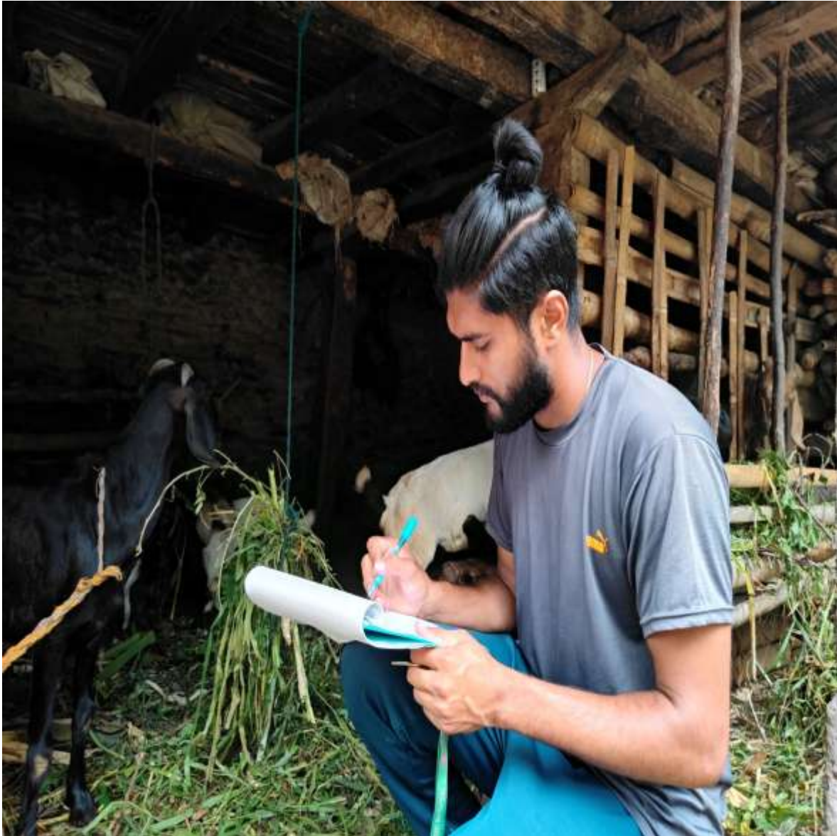
Fig 2: Project leader surveying corral condition to make the support guideline

An assessment was carried out to evaluate the condition of existing livestock corrals. Data were collected regarding past incidents of livestock casualties, structural conditions of the corrals, and the owners' willingness to upgrade. These assessments were used to establish transparent criteria for selecting households eligible for support. The data were collected but the analysis is still ongoing.