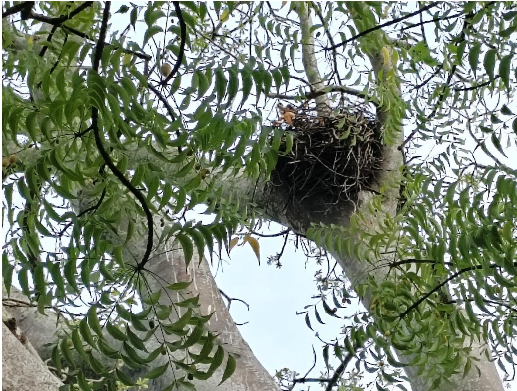
Plate 2: Active Hooded Vulture breeding nest, recorded during field survey

So far, we have surveyed Emi Abumo-Woro community, and three neighboring communities: Emiboci, Eluelu and Gboloko. The survey followed the pentad approach described by Underhill, Brooks & Loftier-Eaton (2017), which is widely used for avian monitoring and biodiversity assessment. During the survey which was conducted in January and February 2026, the project team documented an active hooded vulture breeding nest ( Plate 2 ) within regenerated woodlands at Emi-Abumo-Woro Patti with the help of the community guide ( Plate 3 ). This finding is particularly significant because it provides evidence that the area serves as a breeding refuge for the species.