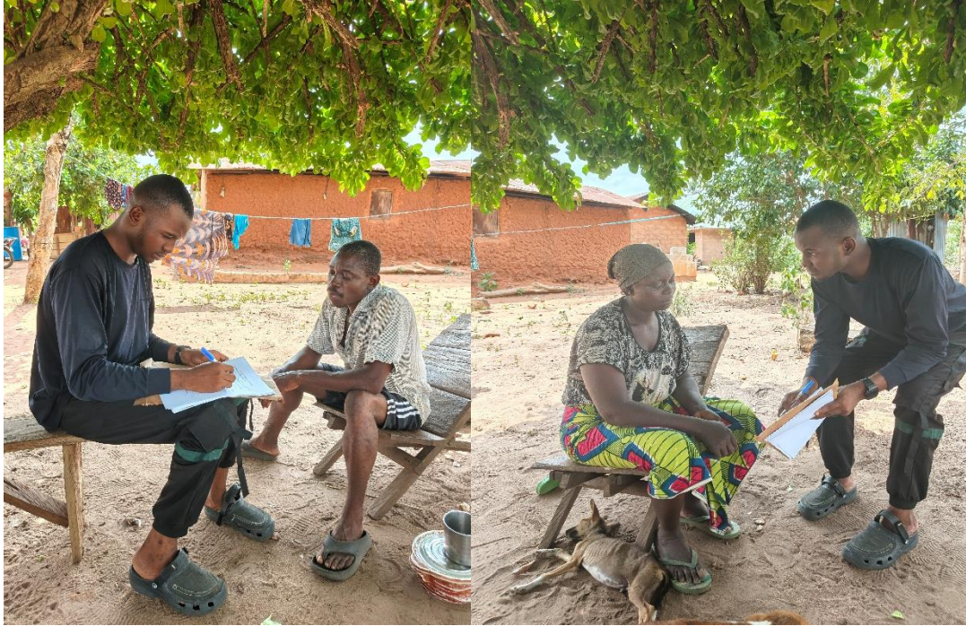
Plate 4a-b: Administration of semi-structured questionnaires to community members during perception and awareness assessment survey