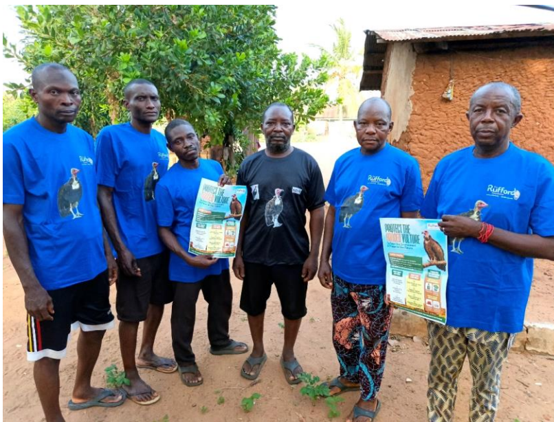
Plate 1: Community leaders and stakeholders during project introduction and consultation meeting, with conservation education materials showing their support for the project.

At the beginning of the project in January 2026, the project team conducted introductory meetings with community leaders and all other key stakeholders within the study communities. The meeting was conducted to formally introduce the project objectives, explain the anticipated conservation benefits of the project and seek community support and permission for project implementation ( plate 1 ). The meeting also provided an opportunity to discuss the ecological importance of vultures and the need for collaborative conservation efforts. The community leaders expressed full support for our project and granted permission to the research team.