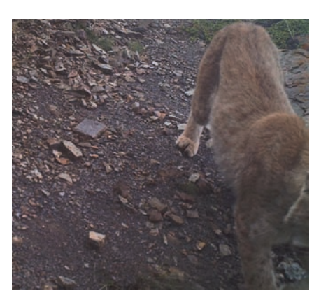
Fig. 3. The Eurasian lynx recorded by a camera trap in Jhong, lower Mustang, in July 2016.