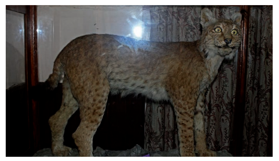
Fig. 2. The taxidermy specimen of Eurasian lynx, in central zoo, Kathmandu, Nepal.

The Eurasian lynx seems rare in Nepal (Jnawali et al. 2011). This study supports the notion as very few records of lynx were found