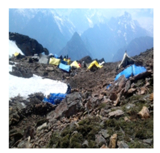
Figure 3. Poor logistics is representing challenges for the harvesters in the alpine meadows