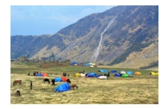
Figure 4. Harvesters' camps and cattle in alpine pasture during harvesting season

animals. These huge aggregations in the remote pastures are bound to destroy the pristine nature of the ecosystems and the threatened species that inhabit them (Figures 3 and 4). Local people and ecologists alike have been complaining about the sharp decline in the abundance of the caterpillar fungus as well as the destruction of the habitats in the concerned areas within a span of a few years. Ultimately, increasing trade-induced over-harvesting seems almost certainly responsible for declining populations of the caterpillar fungus, which needs to be assessed more scientifically.