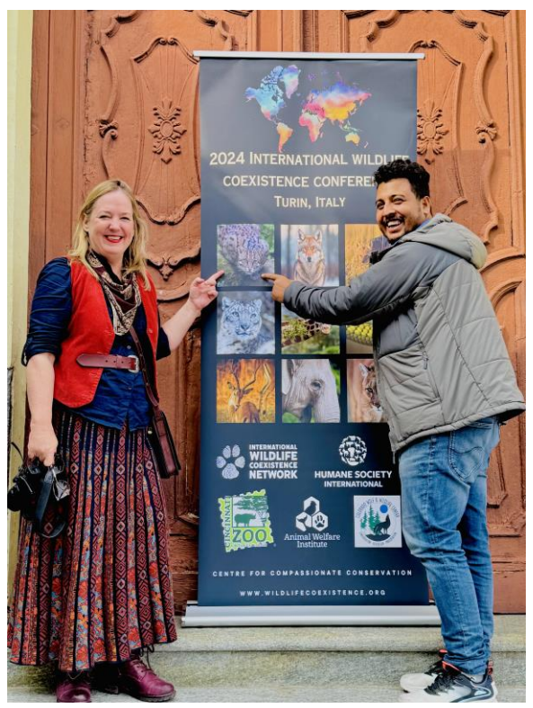
Page 9 of 15