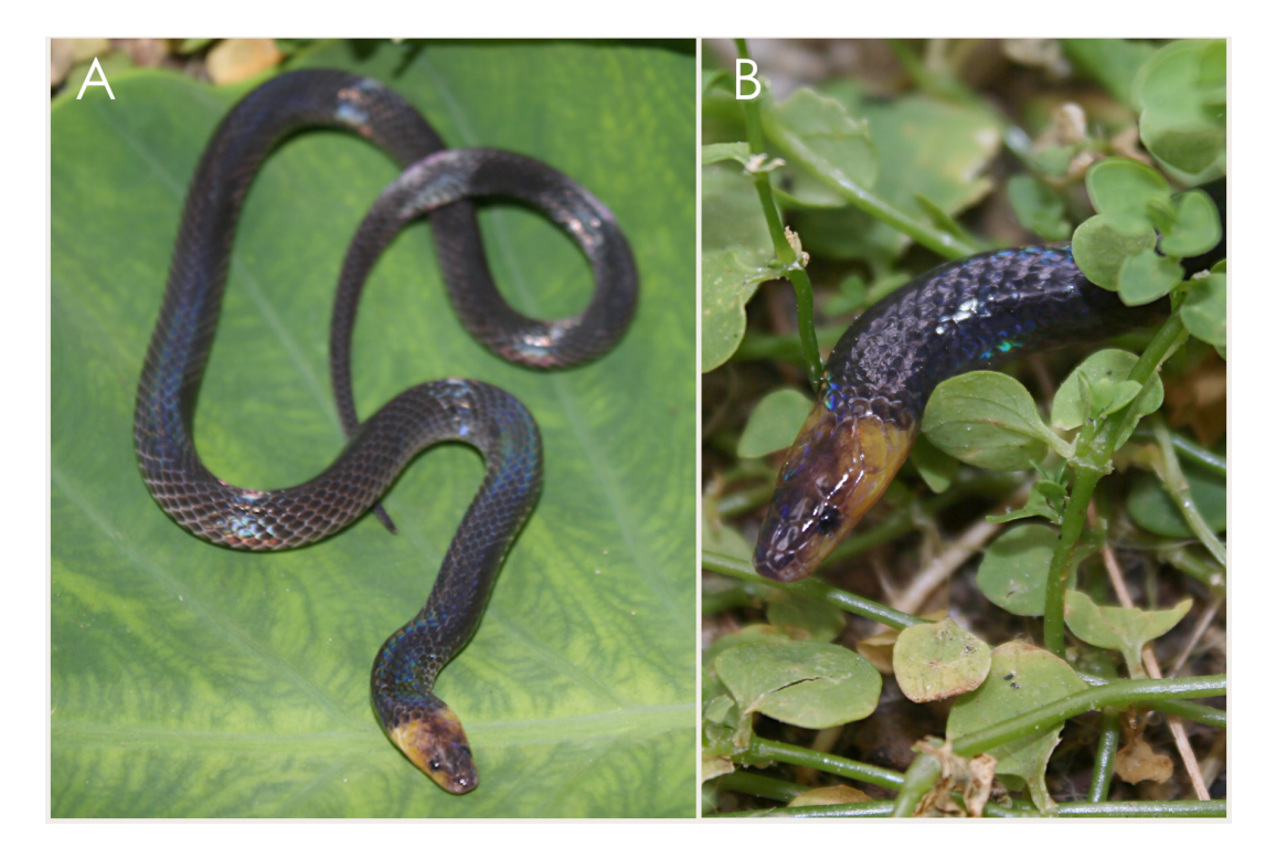
Figure 2. Photos of an unsexed adult Pseudorabdion taylori from Mt. Busa, Sarangani, Philippines (snout–vent length = 304 mm; tail length = 50 mm).

(locally known as the Dakeol Forest) has been proposed as a Wildlife Critical Habitat (DENR, 2020a) and is also within the proposed MBPL. While these designations contribute to the long-term protection of the species, active conservation measures, such as strengthened law enforcement and alternative sustainable livelihood programs, are likely needed to address immediate threats to P. taylori , such as illegal timber extraction, forest thinning (e.g., selective cutting of trees for abaca farming), and forest land conversion (e.g., slash-andburn agriculture).