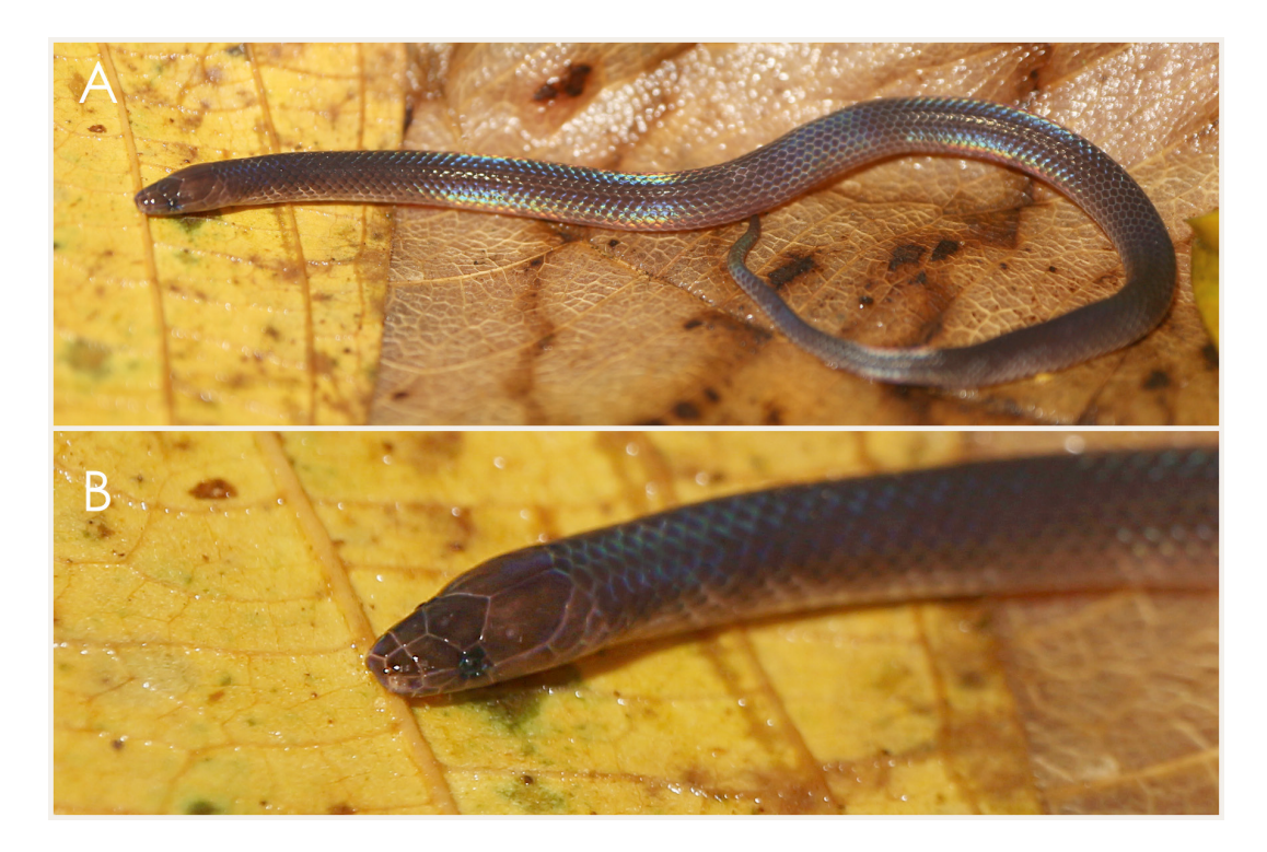
Figure 1. Photos of an unsexed juvenile Pseudorabdion taylori from the southwestern portion of the Busa Mountain Range, Sarangani, Philippines (snout–vent length = 99 mm; tail length = 23 mm).

dorsal scales, tan ventral scales, and a medium brown head (Fig. 1). The adult (SVL = 304 mm; TL = 50 mm) has dark and iridescent indigo-blue dorsal scales, light to medium yellowish-brown ventral scales, a dark brown colouration on the ventral side of the tail, and a yelloworange head (except for the light tan ventral side and dark indigo-blue around the frontal region; Fig. 2). The differences between the juvenile and adult colouration suggest that P. taylori may undergo ontogenetic colour changes.