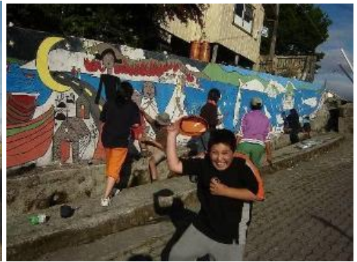
Figure 3: Awareness-raising through artistic activities.

authorities, each with different interests and representing different constituencies. Even local conservationists have highly disparate views as to how to protect the local environment (ranging from the very radical, to those that are willing to tolerate some level of extractive and other disruptive activities).