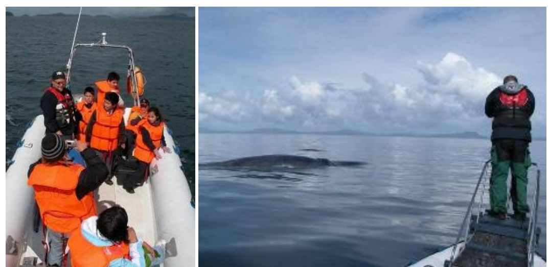
Figure 1: Educational activities with children (left panel) and photo-id work (right panel) undertaken on board CBA vessel. R/V Musculus.

To add to this financial trouble, fuel costs soared during the implementation of the project. Fuel is in fact a key input for all marine based activities. Furthermore, the purchase of a project truck came at a higher cost than budgeted.