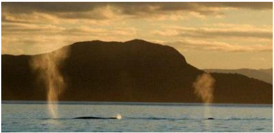
Figure 4: A blue whale mother-calf pair photographed in the Moraleda Channel during field season

5. Outreach material disseminated at various levels. Status: done.