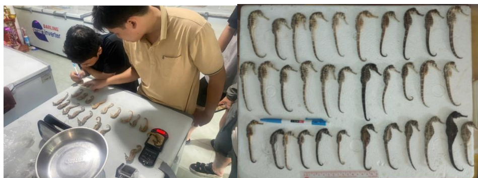
Project members measured body weight and photographed seahorse specimens at a seafood shop owned by the same fisher in the Con Dao Archipelago (left). The photograph was later used to measure individual body lengths using ImageJ software in the laboratory (right)

- Upto date, more than 1,700 seahorse individuals have been measured from the Con Dao Archipelago. Based on morphological identification, three species were confirmed: Hippocampus trimaculatus , H. spinosissimus , and H. kelloggi . All three species are listed as Vulnerable (VU) by the IUCN, included in CITES, and in the Vietnam Red List (2024). Preliminary analyses indicate that H. trimaculatus and H. spinosissimus are being harvested with a biased sex ratio, including many immature individuals and a high number of pregnant males. In contrast, all H. kelloggi specimens recorded were juveniles. Seahorses in the Con Dao Archipelago appear to be under higher fishing pressure compared to those in Phu Quoc Island (Vietnam) and other sites in the region.