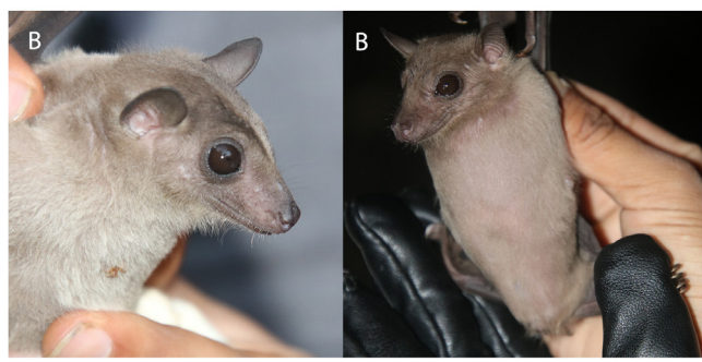
Fig. 2 - Dawn bat Eonycteris spelaea (A) captured from Banpale forest of Institute of Forestry (IoF) Pokhara, Kaski, Nepal with Rousettus leschenaultii (B) captured from Ranipauwa, Myagdi, Nepal during the project under Rufford Roundation, UK. Kidney shaped anal glands (red circle) and tail (red arrow)