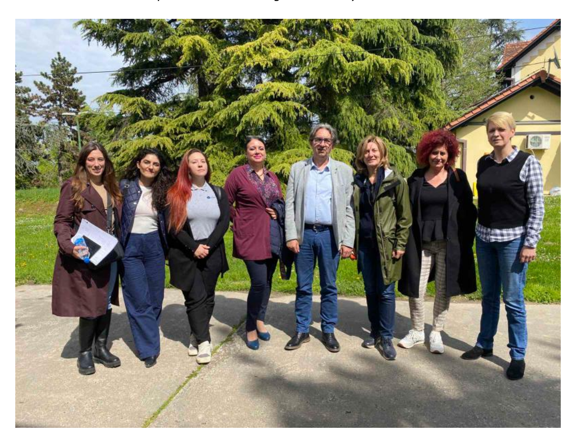
Picture 1. Project team members during the implementation of the project item "Surveys and meetings with protected area managers".