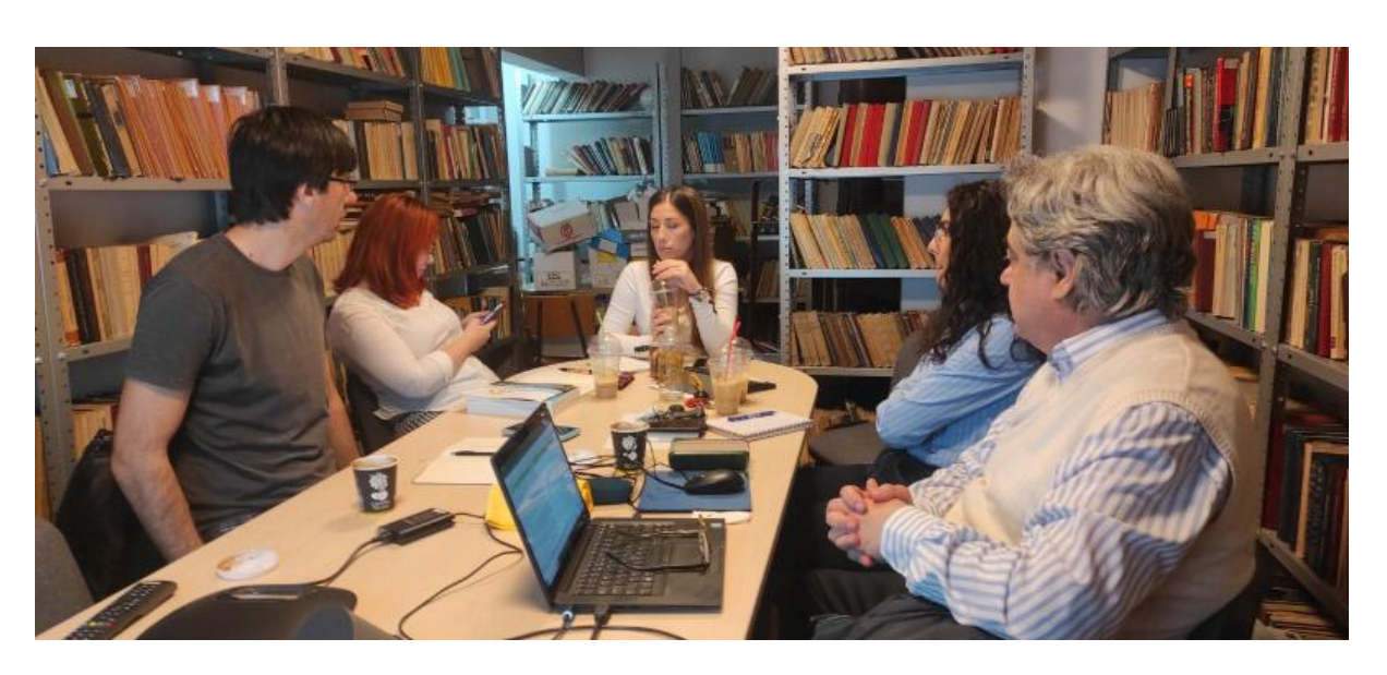
Picture 2. Meeting of project team members during the implementation of the project item "Surveys and meetings with protected area managers".