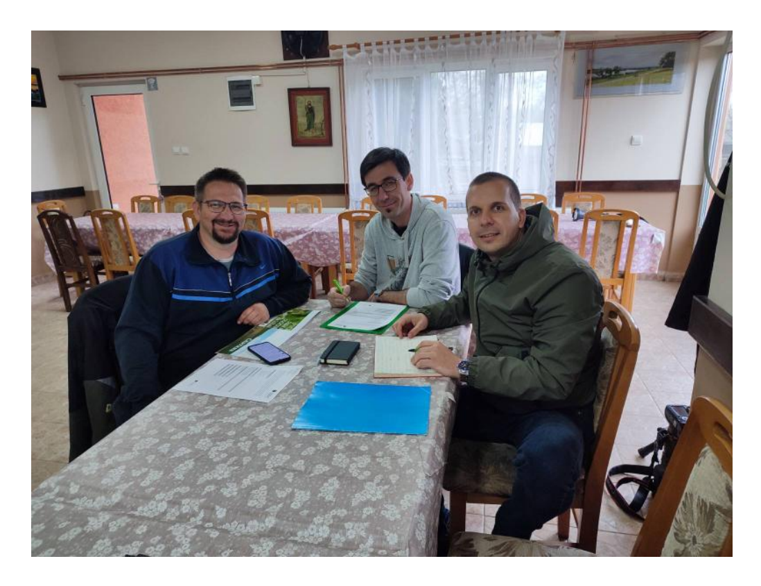
Picture 3. Project team members during the implementation of the project item "Surveys and meetings with protected area managers".