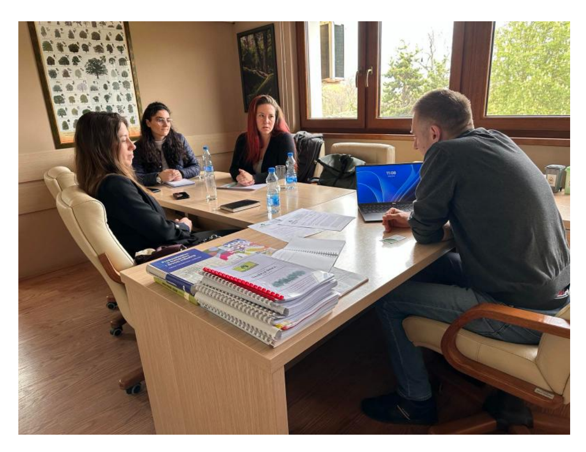
Picture 1. Project team members during the implementation of the project item "Surveys and meetings with protected area managers".