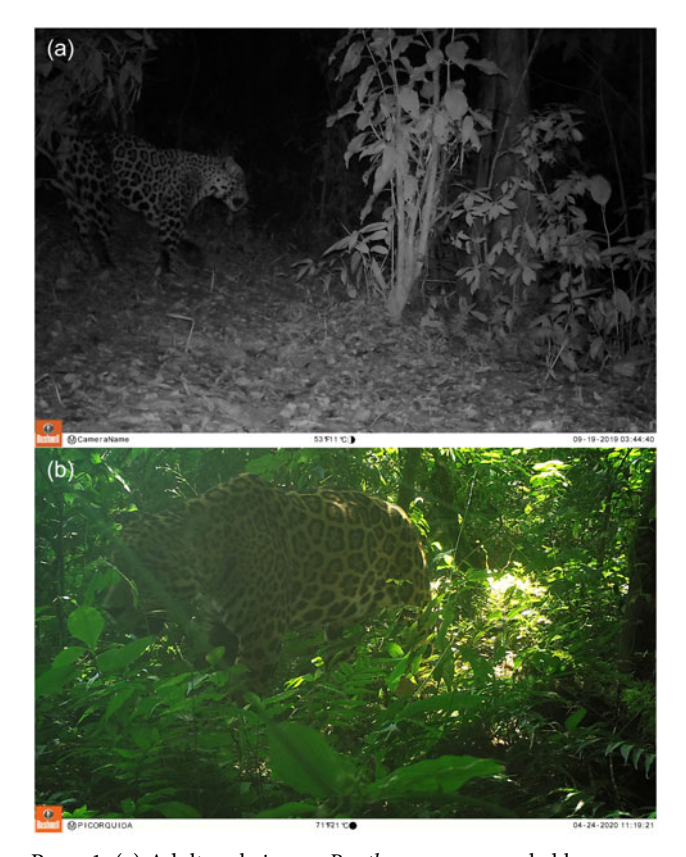
PLATE 1 (a) Adult male jaguar Panthera onca recorded by camera trap 42 on a mountain ridge in Sidras village (Bolivia). (b) Adult jaguar recorded by camera trap 74, 1.45 km from Bermejo River and 5.00 km from Baritú National Park (Argentina).

From our survey we conclude that jaguars are present in the Baritú-Tariquía Biological Corridor, and that their occurrence at several sites and the presence of several individuals suggest that this is a functional corridor for this key jaguar population. The records reinforce the designation of this area as a Jaguar Conservation Unit (Baritú-Calilegua Jaguar Conservation Unit) and support the proposal to connect it with jaguar populations in