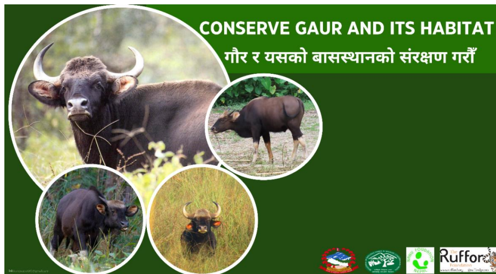
Poster of Gaur ( Bos gaurus ) for conservation awareness

All necessary promotional materials like brochures, leaflets, posters and t-shirts were distributed during the outreach programs. Some new design poster was also prepared before visiting the field. The brochures and pamphlets were also posted in the public places with the purpose of spreading the awareness. The sample of the poster and brochure is attached below.