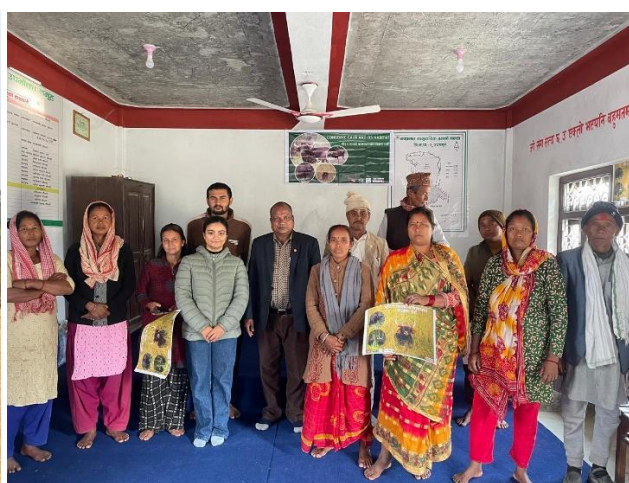
"Gaur Conservation Awareness Workshop to the CFUCs" of Triyuga municipality