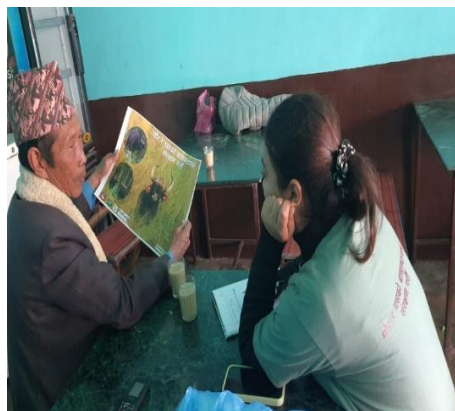
KII with the Division Forest Officer of Katari (L) ,President of Khaijanpur CFUG (R) and President of Ambika CFUG (down)