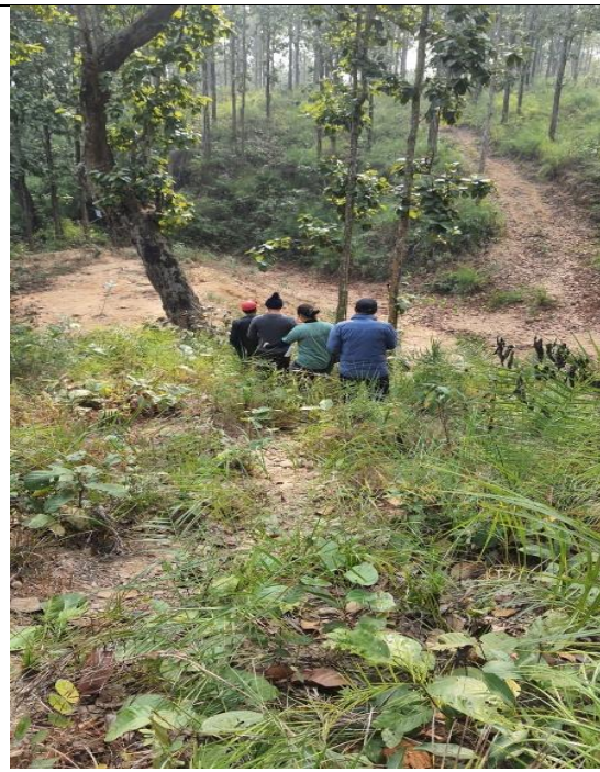
Data collection during field survey