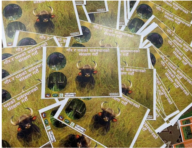
Photos: Sample of t-shirts, posters and brochures ready to be dispatched