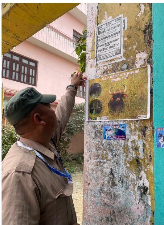
Some photos of conservation posters in the public area (Right and left)