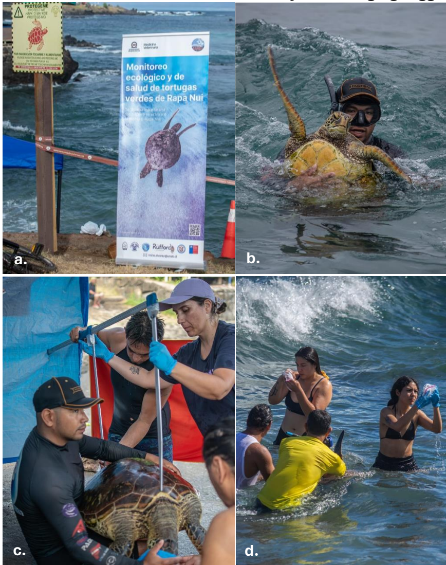
Figure 1. Stages of the ecological and health monitoring process of green turtles in Rapa Nui, March 2026. a) Information roll-up banner of the monitoring program located at the study site; b) Manual capture performed by a specialized diver to transfer the specimen to the evaluation area; c) Recording of body measurements and clinical evaluation of the specimen on land; d) In-water verification of microchip presence using an electronic reader (this procedure allows the identification of previously marked individuals without the need to remove them from the water again).