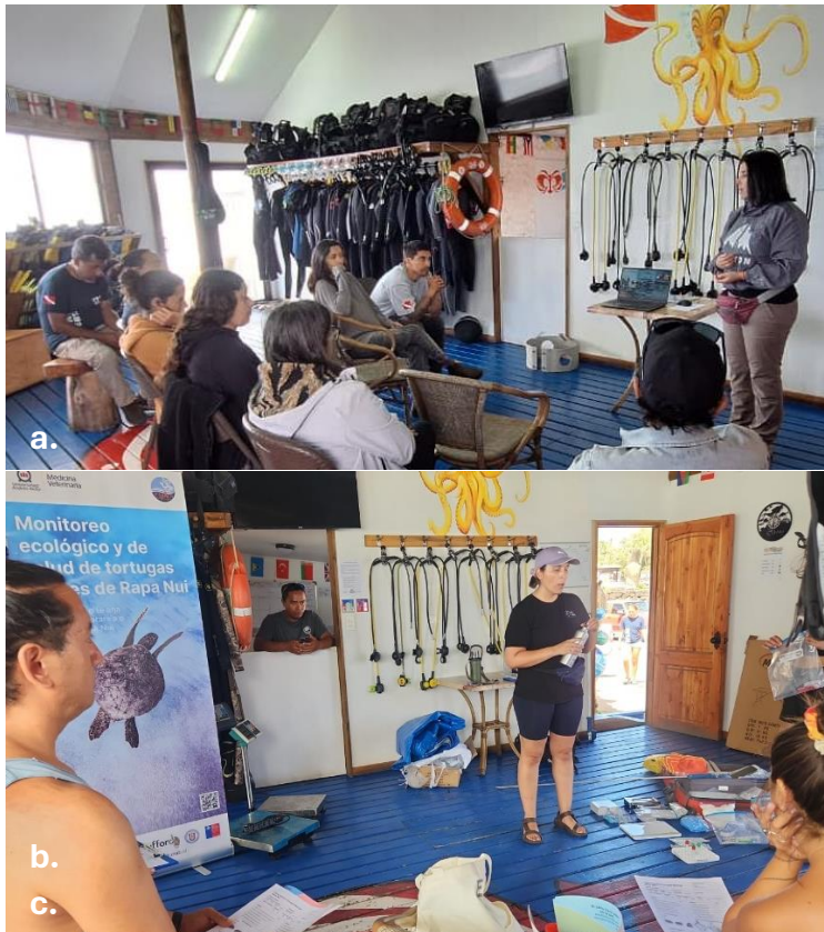
Figure 4. Human capital development and strengthening of local capacities. a) Technical instruction session for local dive center guides, focused on responsible sighting and safety for both divers and green turtle specimens (September 2025); b) [Intentionally removed] Environmental education activity with local school students, aimed at fostering scientific knowledge and promoting a sense of belonging (September 2025); c) Practical training on the use of green turtle monitoring equipment (March 2026).