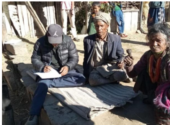
Figure: Household survey on Human-wildlife conflicts with the local of Sarkegad Rural Municipality, lower Humla.