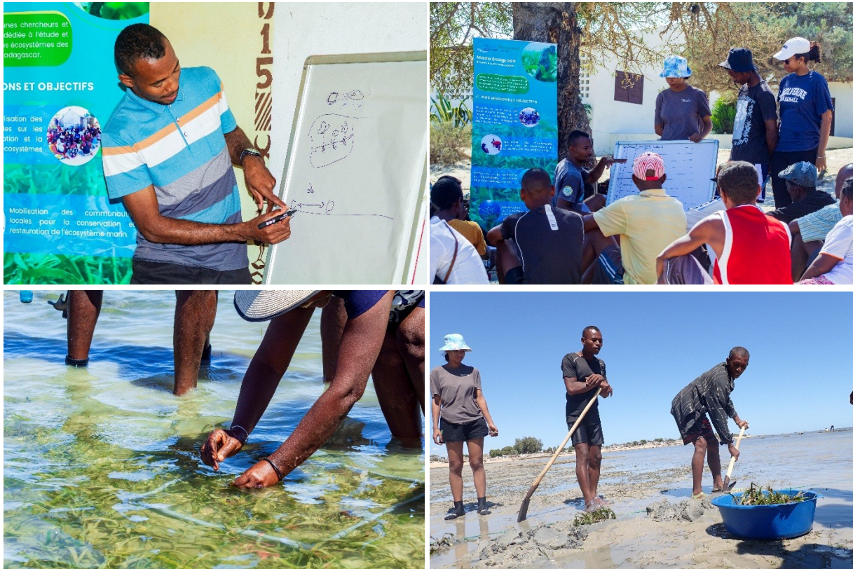
Figure 4: Illustrative photos from the training session with local communities on techniques for participatory monitoring and restoration techniques of the seagrass ecosystem in Ranobe Bay, Southwest Madagascar © Rodin Boleslas.