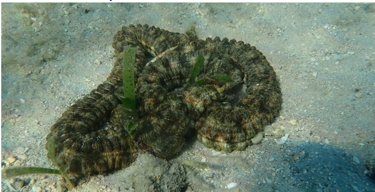
Synapta maculate © BEVA Grilante.