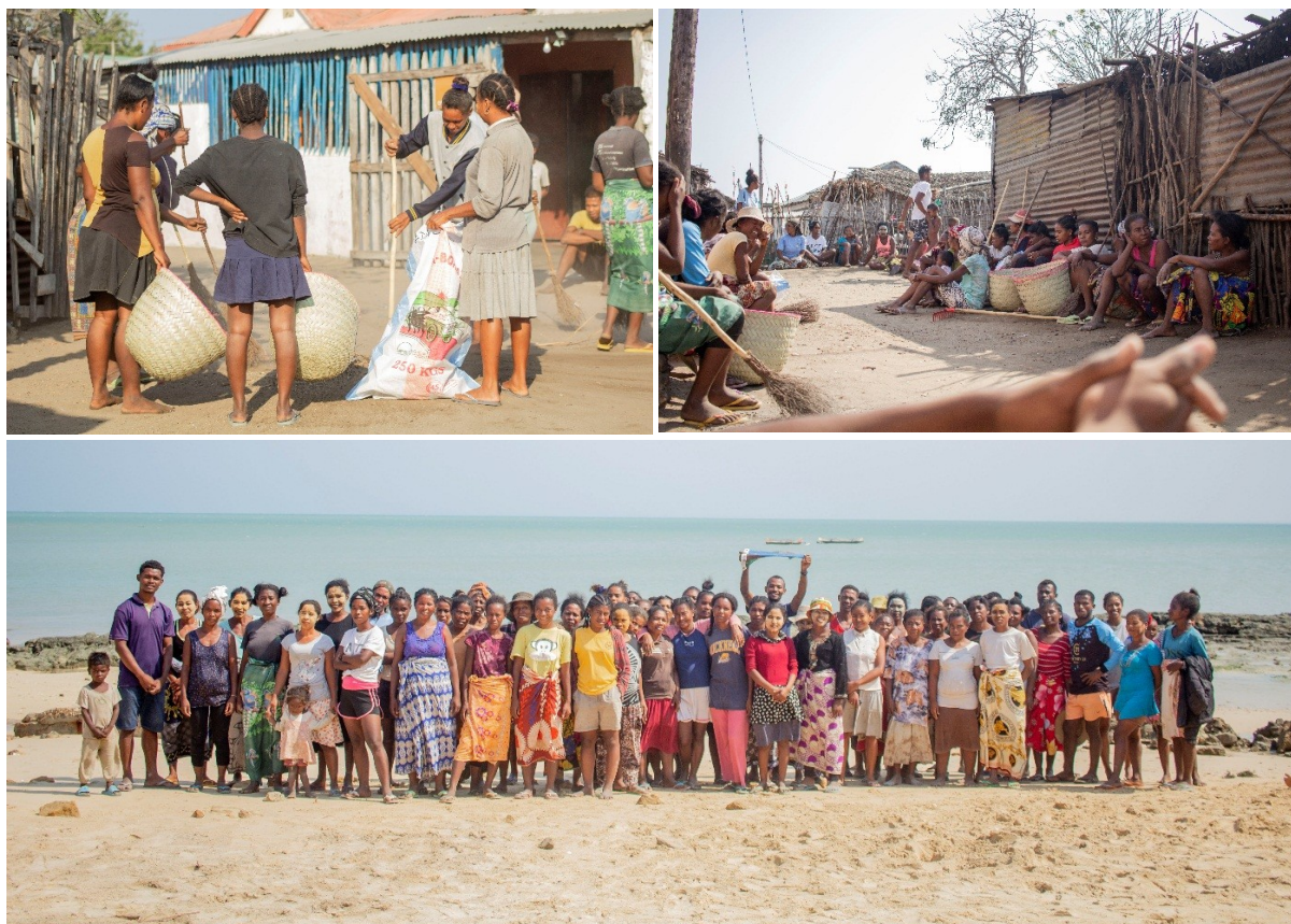
Figure 6: Illustration photo during the World clean-up day event

On World Cleanup Day (september 20, 2024), community volunteers were mobilized to participate in the cleanup of the village and the beach at Ifaty. More than 80 locals' communities' members participated in this event. During this campaign, a Mada Seagrass association teams takes the opportunity to raise awareness among the local communities about the impacts of plastic pollution on marine ecosystems and biodiversity.