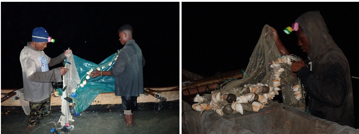
Figure 5: Photo showing the fishermen using destructive fishing gears (Beach seining) in the seagrass bed during the low tide © BEVA Grilante.

For the surveillance of the restored areas, a patrol campaign was also conducted from September 17 to 18, 2024, during which 3 canoes with 6 fishermen practicing destructive fishing gears (beach seining) were apprehended. The fishermen were given a warning. Thanks to the commitment of the local communities, patrol campaigns will continue during periods of spring low tides.