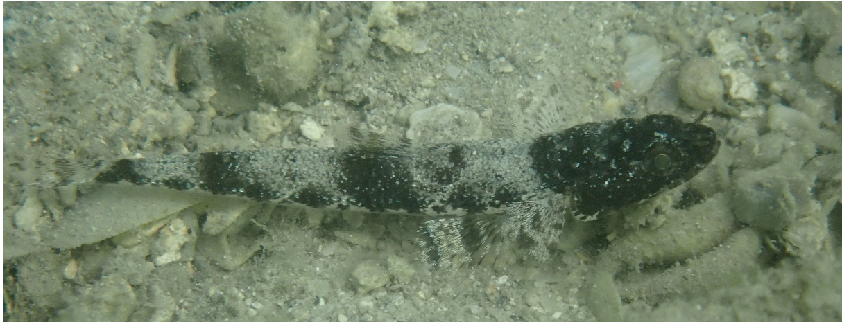
Fish species associate on seagrass ecosystem has been observed in the restoration site in Ifaty.