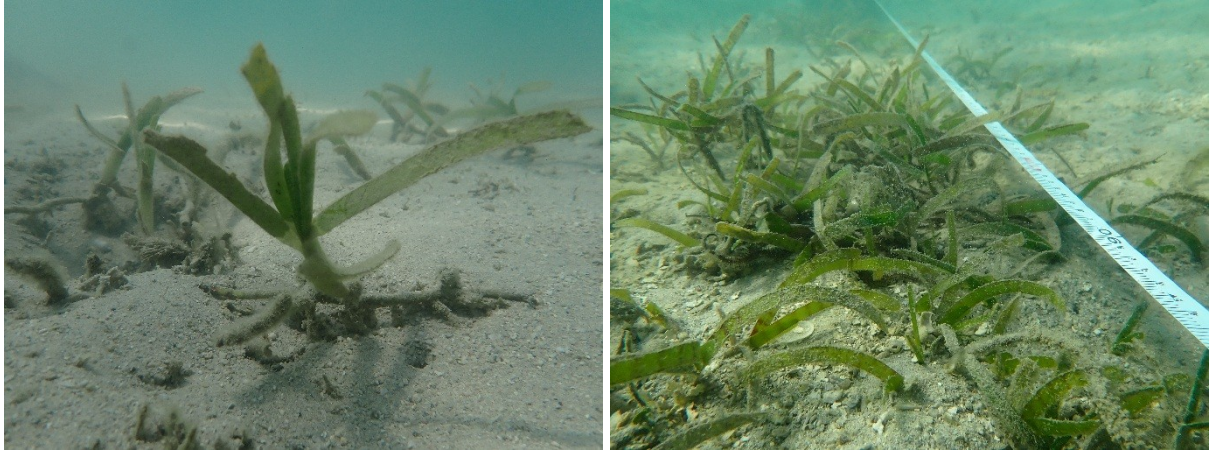
Figure 2: Transplantation of seagrass after five months (left in Beravy and right in Ifaty)