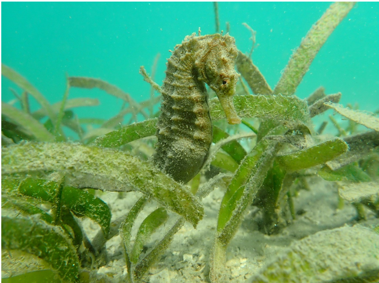
Hippocampus borboniensis is one of the species of hippocampus within the Syngnathidae family. This species is threatened with extinction and is listed on the IUCN Red List.