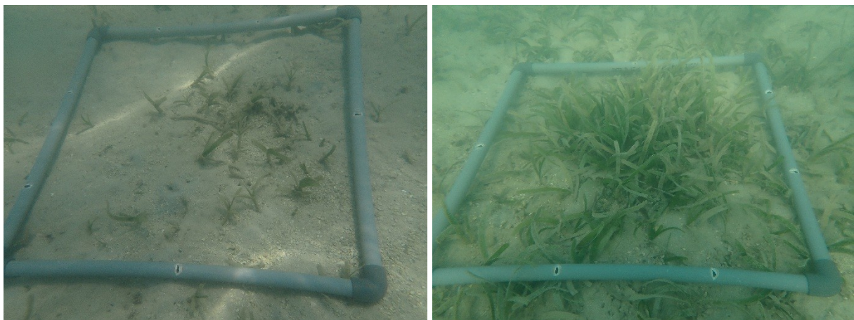
Figure 3: Seagrass recovery in the restoration site after five months of transplantation (left in Beravy and right in Ifaty) © BEVA Grilante.