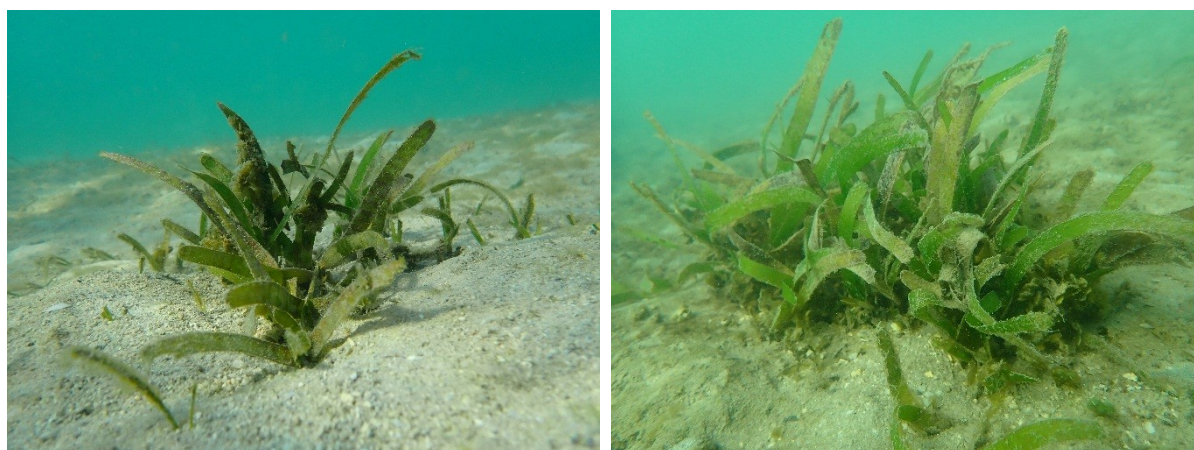
Figure 1: Transplantation of seagrass after one month (left in Beravy and right in Ifaty) © BEVA Grilante.

After five months of transplantation, monitoring conducted from October 26th to 29th, 2024, indicates that the average survival rate of the transplants is 38.73 \pm 15.03\% in Beravy and 81.54 \pm 8.95\% in Ifaty. The recovery of seagrass varies by transplantation site. In October, the mean coverage rate in Beravy is 5.27 \pm 10.21\% , while in Ifaty, it increases to 42.37 \pm 27.57\% . The transplantation site in Beravy is affected by high sediment retention, which has led to transplant mortality and prevent to the proper growth of seagrass shoot.