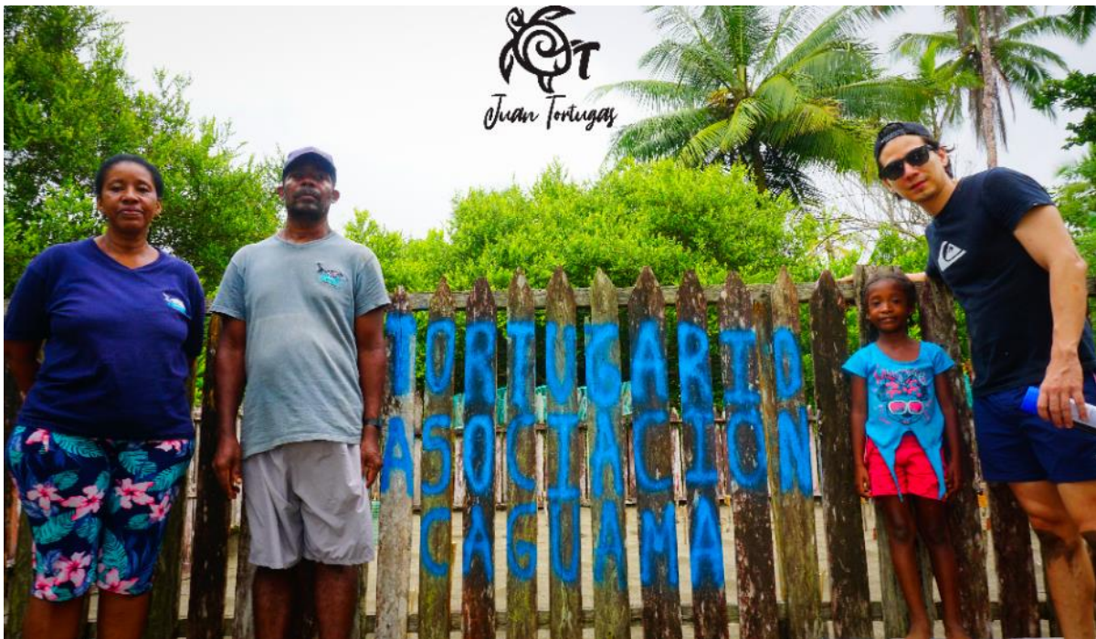
Figure 9. Painting sign in the artificial hatchery.

We train Caguama Association in social networks. They created and enhanced profiles in Instagram and Facebook, showing activities and different services offered to tourists who were interested in environmental and species conservation. An example was the contribution, sightings, and adoption of sea turtles. It is here where the association gives a special mention to tourists, allowing them to name a protected animal within the conservation program. This process can be seen in the networks (Instagram post https://www.instagram.com/p/CHOjfnDDaUa/ , Figure 9), as mentioned earlier.