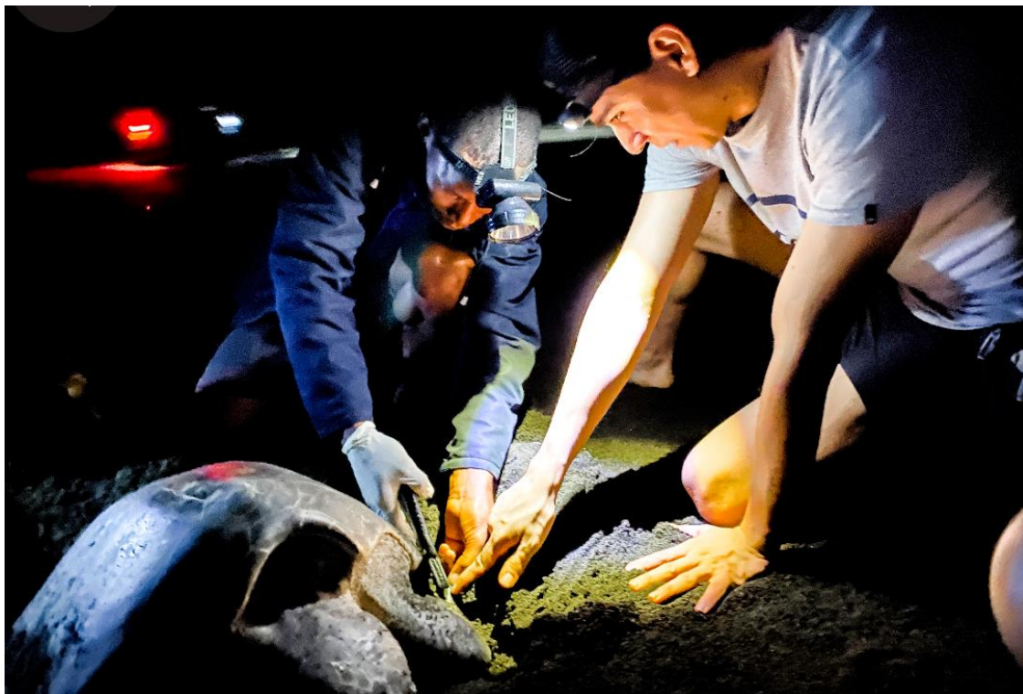
Figure 4. Trainer explaining how to tag a sea turtle with metal tags.