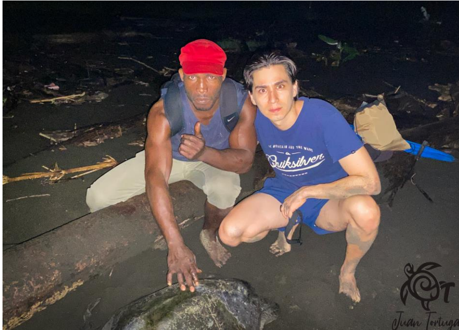
Figure 10. Local inhabitant that used to poached sea turtles and project leader after making a deal about the sea turtle eggs.