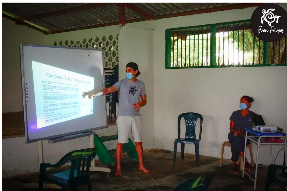
Figure 6. Training workshop implemented in Nuquí Choco, Colombia Pacific.