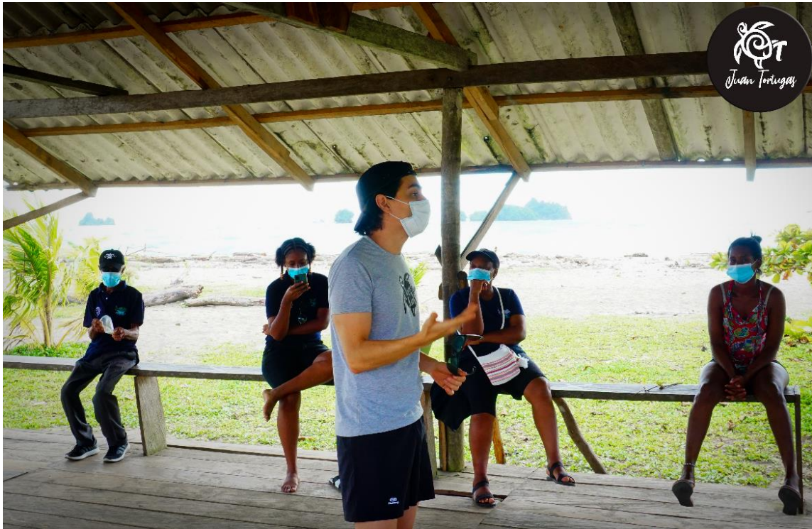
Figure 7. Training workshop implemented in Nuquí Choco, Colombia Pacific.