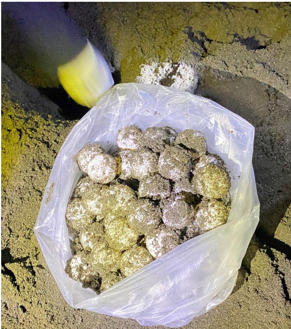
Figure 5. Bag with eggs ready to be transported to the hatchery.