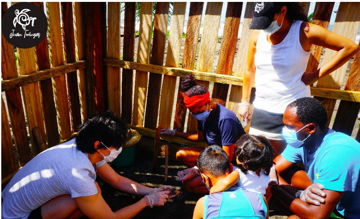
Figure 8. Exhuming a nest three days post hatchling process.