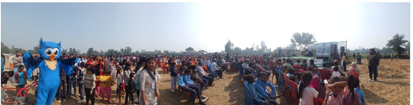
Participants at Nepal Owl Festivals 2025