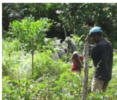
Ambodivoangy Training FTTFA

Due to a minor chrysalide shortage at the beginning of the training, senior members shared the first batch of chrysalides while the others followed along and assisted whenever possible. For the next generation, the junior members will receive chrysalides and the senior members will continue to expand their current stock.