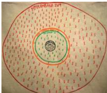
Membership Breakdown, Updates for 2012

At the meeting, participants discussed updates from SEPALI, the current status and goals of the program and production statistics. Currently, the SEPALI program boasts 269 members (red circle), 51 of which have already planted their trees (orange circle), 45 of which received silkworm rearing training and equipment (green circle), and 14 of which have already produced cocoons (black circle). SEPALI members have already planted over 20,000 trees and 25,000 more are growing in their nurseries. Our women's groups sewed over 32 meters of textile this year.