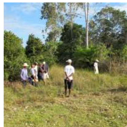
SEPALI's New Land, Varingohitra