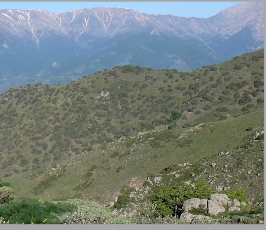
Trail guide for butterfly-watching