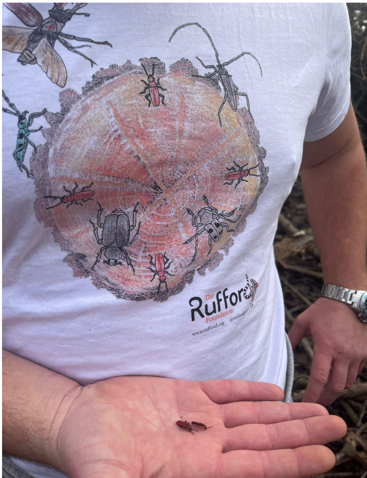
Photo 14. Adult of the Cucujus cinnaberinus - Novi Sad