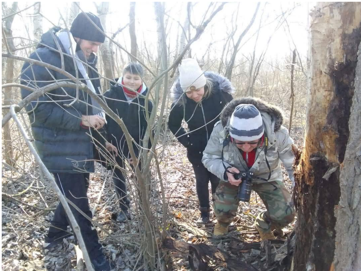
Photo 9. Field research - River Tisa