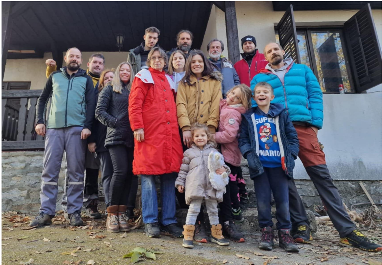
Photo 1. Part of the project team members and members of the NGO Habiprot