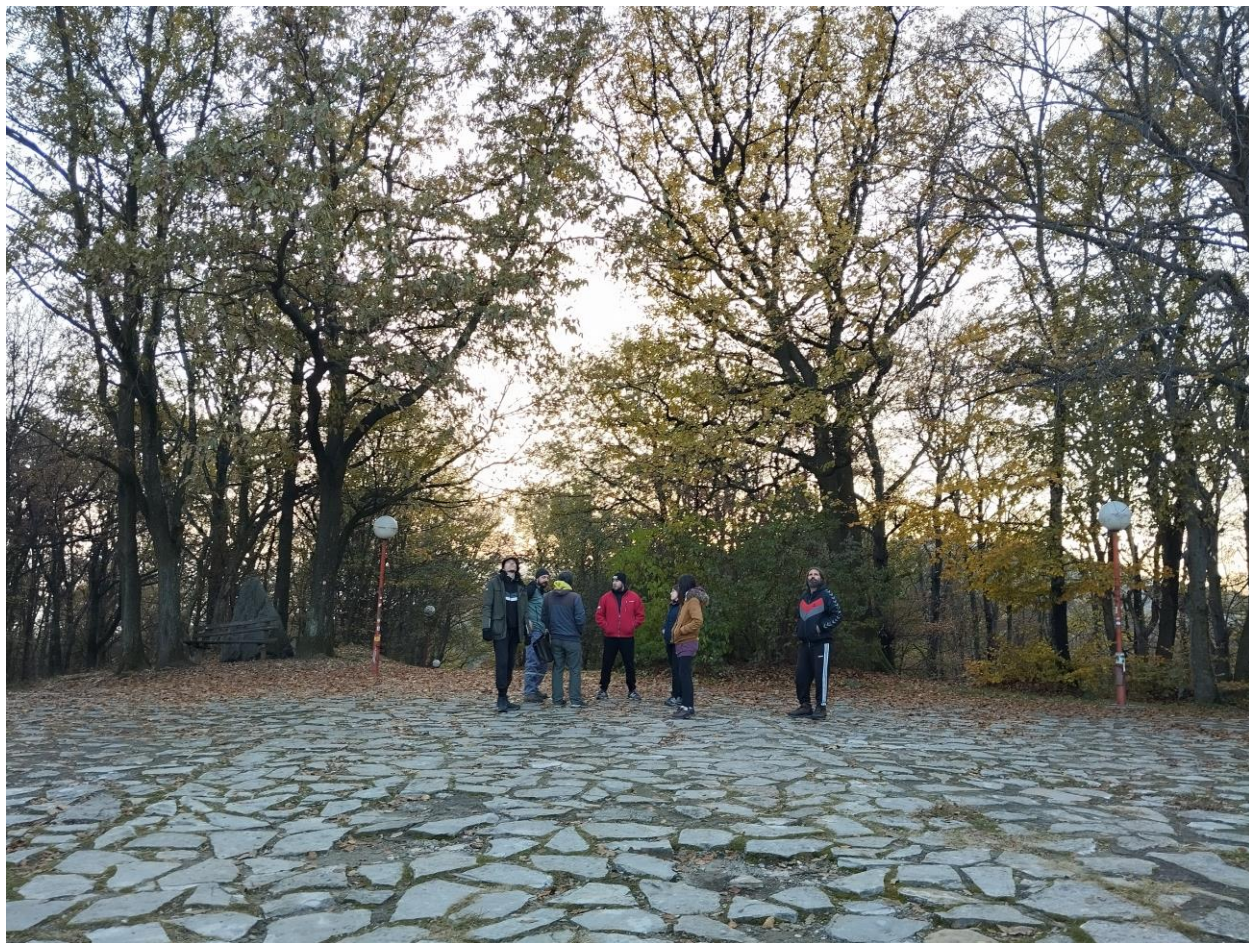
Photo 2. Part of the project team members and members of the NGO Habiprot