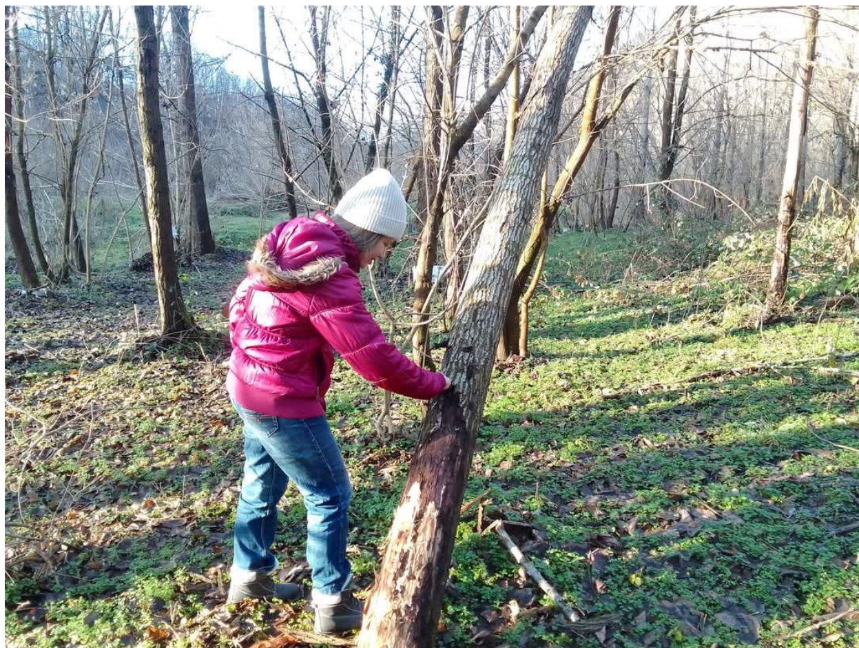
Photo 13. Field research - River Ibar