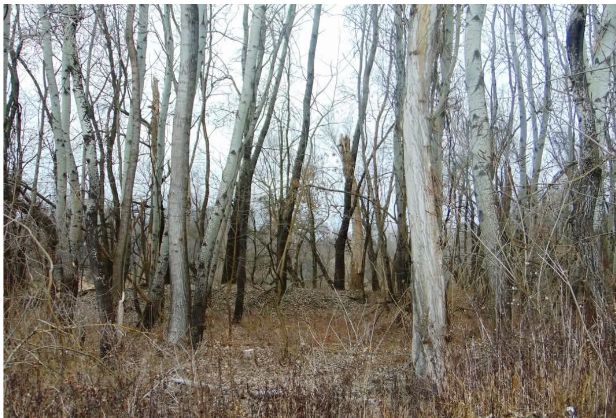
Photo 11. Habitat of Cucujus cinnaberinus in the Special Nature Reserve “Ritovi donjeg Potisja”