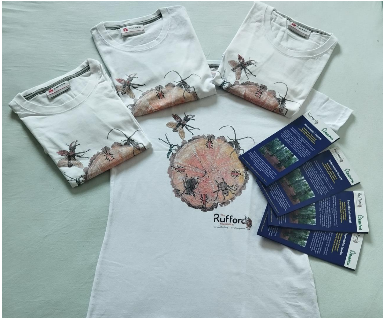
3. Promotional materials (t-shirts, brochures)