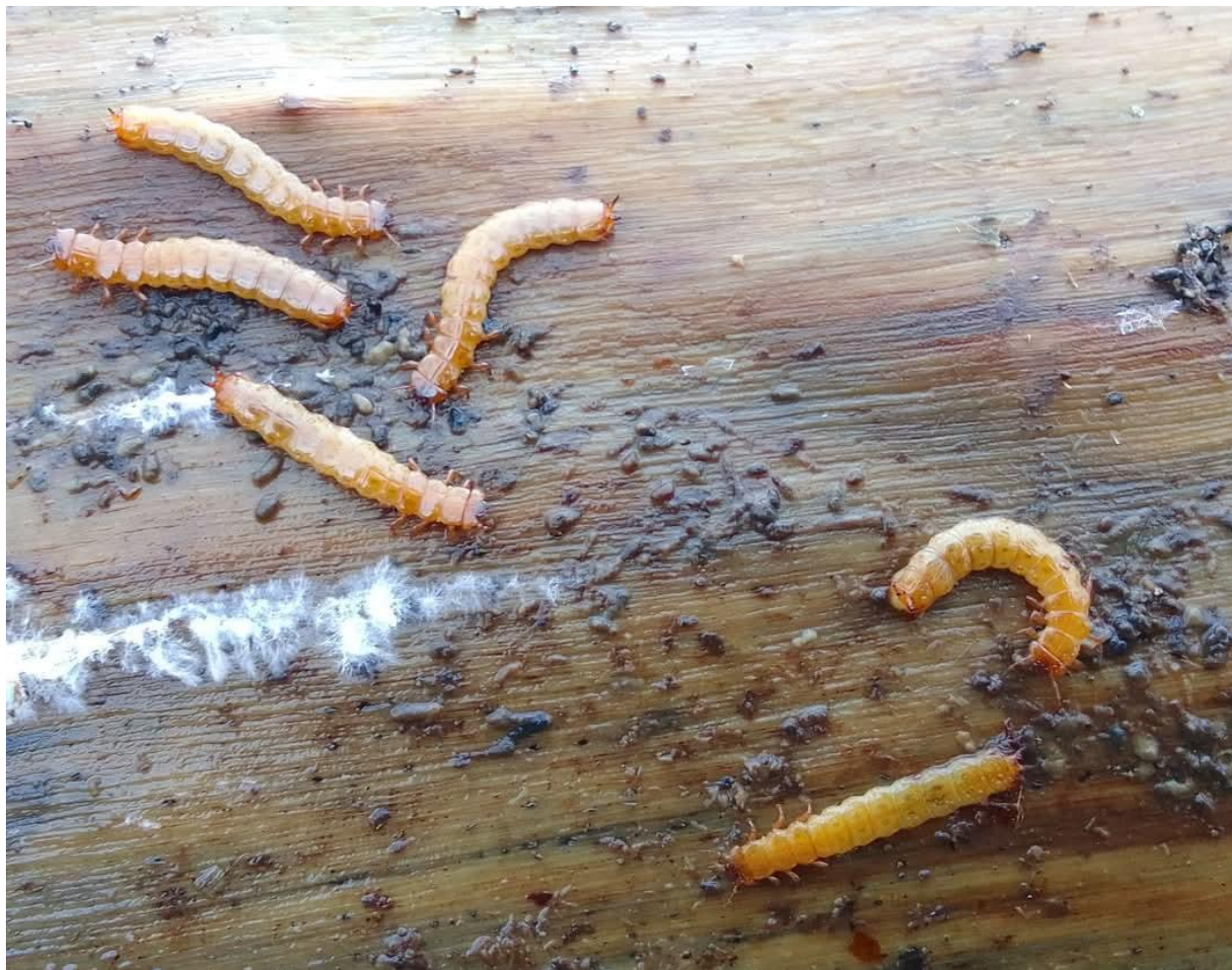
Photo 4. Cucujus cinnaberinus - larva